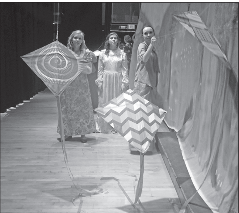
Members of the Banks family prepare to fly kites during the dress rehearsal of the Stockton Theatre Department's production of Mary Poppins.

Banks to head out with his children and finally fly that kite, the moment truly sends our hearts soaring. The Stockton Theatre Department production of Mary Poppins is an enchanting mixture of irresistible story, unforgettable songs, breathtaking dance numbers and astonishing stagecraft. It is charming, magical, and surprising and was a perfect outing for the whole family.