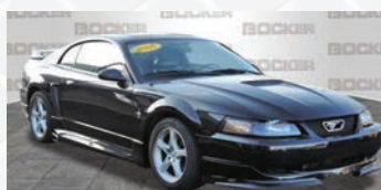
Stock #26093A 2001 Ford Mustang Base Black clearcoat, 3.8L 6 cyl., manual, 64k miles. $7,999