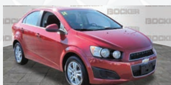
Stock #6387 2014 Chevy Sonic LT Crystal red tintcoat, 1.8L 4 cyl., auto, 30k miles. $11,950