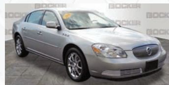
Stock #63471 2008 Buick Lucerne CXL Platinum metallic, 3.8L 6 cyl., auto, 81k miles. $8,475