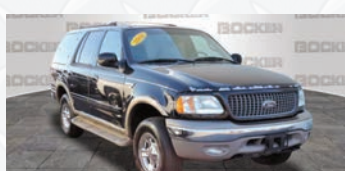
Stock #270673 2002 Ford Expedition Eddie Bauer Black clearcoat, 5.4L 8cyl, auto, 152k miles. $3,400