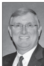
By BRIAN STEWART State Representative

In a classic case of the government trying to solve a problem that doesn't exist, the sad humor is that the free market already has a solution. But wait, there's more. Not only does the free market have a solution; the free