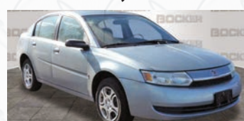
Stock #265484 2003 Saturn Ion Ion 2 Bright blue, 2.2L 4 cyl., manual, 191k miles. $1,500