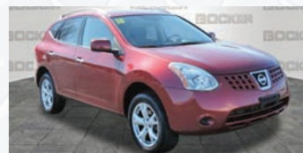
Stock #63771 2010 Nissan Rogue SL Venum red pearl, 2.5L 4 cyl., continuous, 152k miles. $8,888