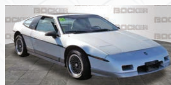
Stock #6315A 1986 Pontiac Fiero 6T Silver, 2.8L 6 cyl., auto 56k miles. $3,999