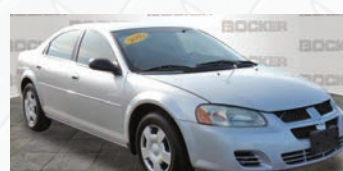
Stock #63561 2005 Dodge Stratus SXT Silver, 2.7L 6 cyl., auto 141k miles. $1,999