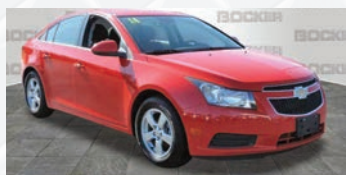
Stock #6383 2014 Chevy Cruze-1 LT Red, 1.4L 4 cyl., auto, 28k miles. $14,950