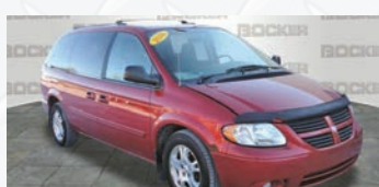
Stock #370352 2006 Dodge Grand Caravan SXT Red, 3.8L 6cyl., auto, 166k miles. $2,775