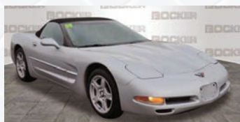
Stock #27514B 1988 Chevy Corvette Silver, 5.7L 8 cyl., manual 99k miles. $13,990