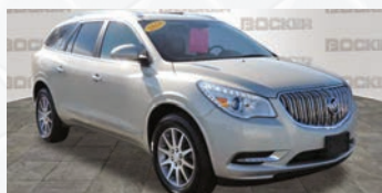
Stock #279181 2014 Buick Enclave Champagne silver metallic, 3.6L 6 cyl., auto, 44k miles. $25,900