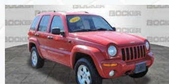
Stock #275092 2002 Jeep Liberty LTD Flame red clearcoat, 3.7L 6 cyl., auto, 116k miles. $5,250