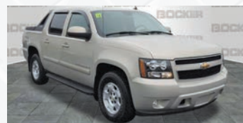
Stock #63661 2007 Chevy Avalanche LT Gold Mist Metallic, 5.3L 8 cyl., auto, 124k miles. $13,950