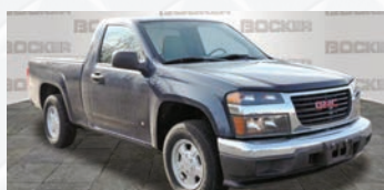
Stock #272071 2007 GMC Canyon SL Blue, 2.9L 4 cyl., manual, 91k miles. $6,999