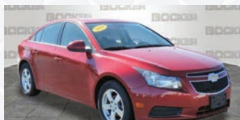
Stock #271901 2014 Chevy Cruze-1 LT Crystal red tintcoat, 1.4L 4 cyl., auto, 43k miles. $12,975