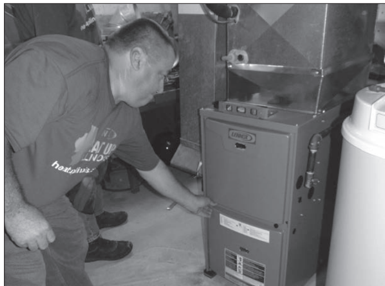
The new high-efficiency furnace from Lennox is installed in the Hollingsworth home.