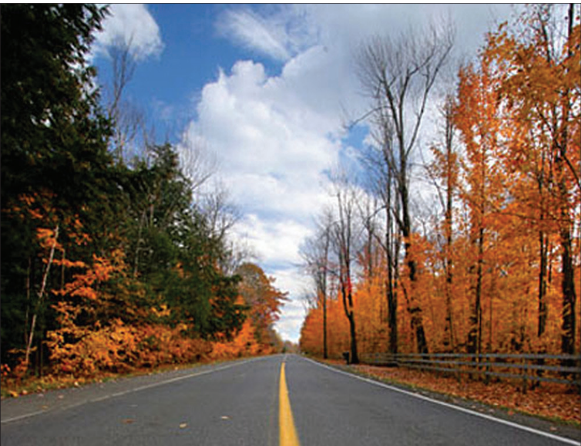
Wet leaves on the road surface can make stopping difficult, and piles of leaves can hide potholes, curbs and street markings.

“ Add to these hazards the fact that road conditions can change from ideal to miserable in a matter of minutes, and what you have is a potentially dangerous situation.” — Rich White, executive director of the Car Care Council