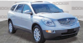
Stock #275472 2011 Buick Enclave CXL1 Quicksilver met., 3.6L 6 cyl., shiftable auto, 110k miles. $13,996