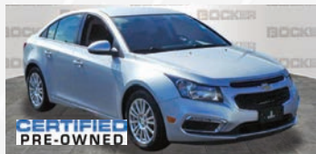
Stock #282221 2015 Chevy Cruze Eco Silver ice metallic, 1.4L 4 cyl., 6 sp. manual, 12k miles. $14,900