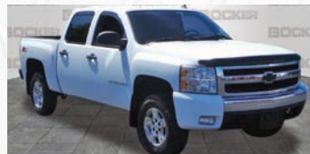
Stock #381093 2008 Chevy Silverado 1500 LTZ Summit white, 5.3L 8 cyl., 4 sp. auto, 137k miles. $14,900