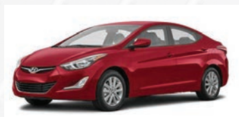
Stock #64982 2014 Hyundai Elantra Venetian red, 1.8L 4 cyl., 6 sp. auto, 57k miles. $12,900