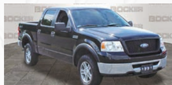
Stock #381211 2006 Ford F-150 Black clearcoat, 5.4L 8 cyl., 4 speed auto, 110k miles. $12,900