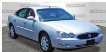
Stock #280531 2005 Buick LaCrosse CX Sterling silver met., 3.8L 6 cyl., 4 sp. auto, 76k miles. $6,500