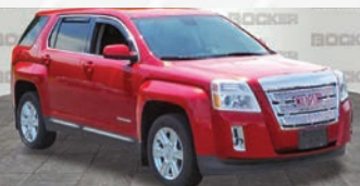
Stock #380001 2013 GMC Terrain-SLE Crystal red tintcoat, 2.4L 4 cyl., shiftable auto, 118k miles. $12,900