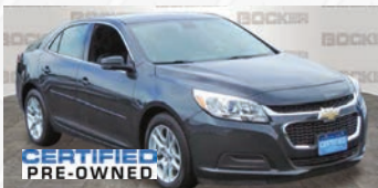
Stock #65351 2015 Chevy Malibu LT Ashen grey metallic, 2.5L 4 cyl., 6 sp. shiftable auto, 54k miles. $14,900