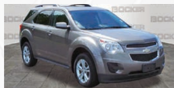
Stock #380053 2012 Chevy Equinox Mocha steel met., 2.4L 4 cyl., shiftable auto, 110k miles. $10,900