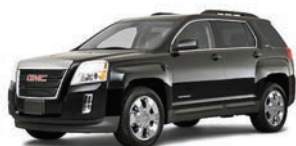
Stock #381251 2010 GMC Terrain SLT-2 Onyx black, 3.0L 6 cyl., shiftable auto, 143k miles. $9,995