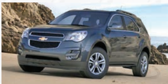
Stock #6548 2014 Chevy Equinox LT Black, 3.6L 6 cyl., shiftable auto, 113k miles. $13,900