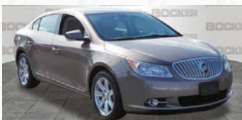
Stock #65501 2011 Buick LaCrosse Mocha steel met., 3.6L 6 cyl., shiftable auto, 58k miles. $12,900