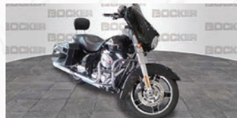
Stock #65272 2011 Harley Davidson FLHX Black, 1690 fuel injected, 12k miles. $13,900