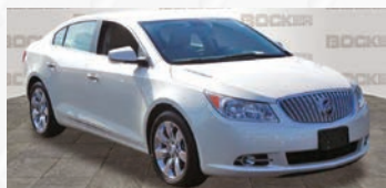
Stock #295011 2011 Buick LaCrosse White diamond, 3.6L 6 cyl., shiftable auto, 96k miles. $11,900