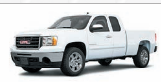
Stock #65231 2010 GMC Sierra 1500 Summit white, 5.3L 8 cyl., shiftable auto, 168k miles. $10,995