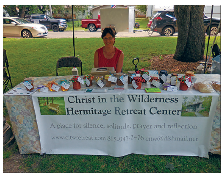
The Scoop Today