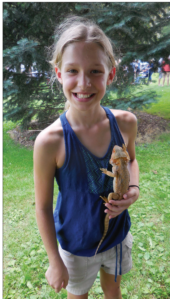
TONY CARTON PHOTO The Scoop Today