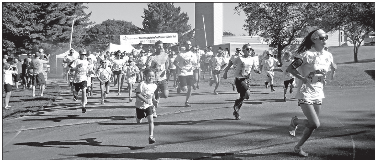
TONY CARTON PHOTO The Scoop Today

"This is not your average color run," said Donth-Carton. "These are nature trails with hills and dales, pastures and prairies, hiking paths and roadways, some uneven surfaces that will offer a mild challenge to