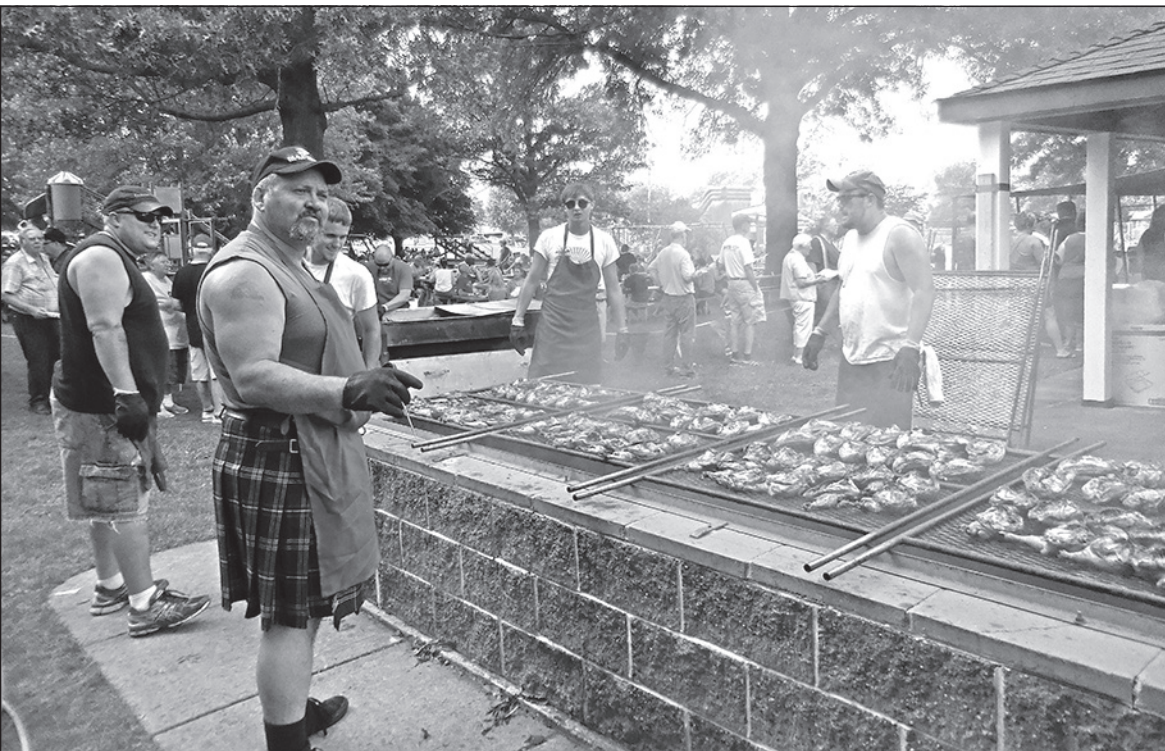
TONY CARTON PHOTOS The Scoop Today