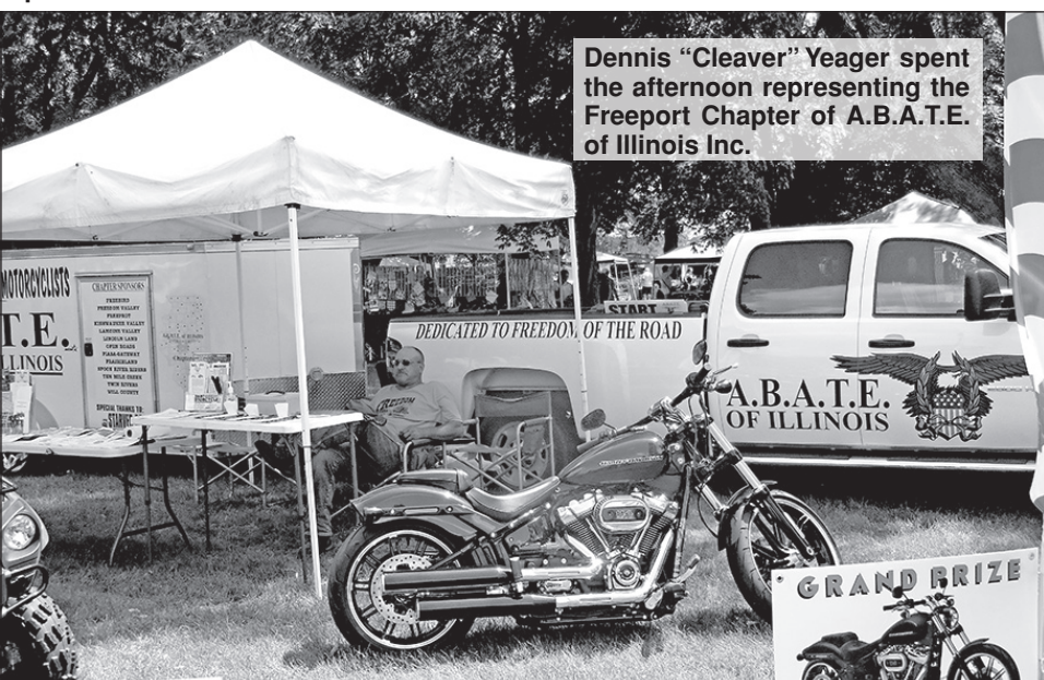
Dennis "Cleaver" Yeager spent the afternoon representing the Freeport Chapter of A.B.A.T.E. of Illinois Inc.

The beverage station in the chicken line is very busy when the heat index readings top 100.