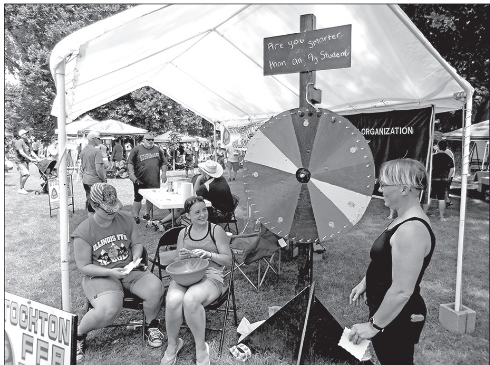
Did you match wits with a Stockton FFA member during the July Fourth festivities?