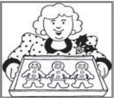
The not so skinny cook

Can you believe we are getting so close to Christmas? I need to get somewhere to do a little Christmas shopping. I also need to get some cookies baked. Since we are talking about Christmas, this week's recipes are more than cookies. (If you read last week, you know I over-loaded on cookies!) So this week there are some recipes for a salad, vegetable, main dish, dessert and candy.