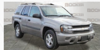
Stock #295201 2005 Chevy Trailblazer LS Greystone met., 4.2L 6 cyl., 4 sp. shift. auto, 113k miles. $7,995