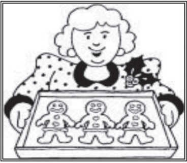
The not so skinny cook

We did have some normal January weather this past week, so it is time for some good soup recipes. This week we have two soups, a great appetizer, an interesting salad, and two desserts.