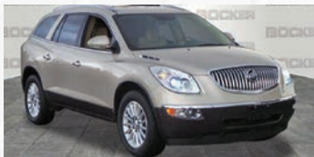
Stock #273122 2010 Buick Enclave Gold mist met., 3.6L 6 cyl., shiftable auto, 106k miles. $9,999