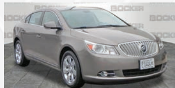
Stock #284381 2011 Buick LaCrosse CXL Mocha steel met., 3.6L 6 cyl., shiftable auto, 57k miles. $11,900