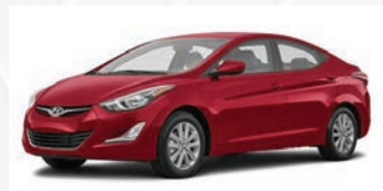
Stock #64982 2014 Hyundai Elantra Venetian red, 1.8L 4 cyl., 6 speed auto, 57k miles. $9,999