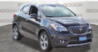
Stock #283961 2014 Buick Encore Carbon black met., 1.4L 4 cyl., shiftable auto, 41k miles. $14,544