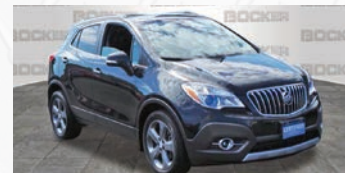
Stock #285341 2014 Buick Encore - Leather Carbon blk. met., 1.4L 4 cyl., shiftable auto, 47k miles. $14,999