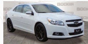
Stock #284401 2013 Chevy Malibu LT Summit white, 2.5L 4 cyl., 6 sp. shift. auto, 80k miles. $11,900