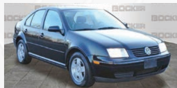
Stock #282223 2002 Volkswagen Jetta Sedan Black, 2.0L 4 cyl., 4 sp. auto, 159k miles. $4,495