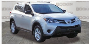
Stock #282671 2014 Toyota Rav4 LE Classic silver metallic, 2.5L 4 cyl., shiftable auto, 83k miles. $13,989