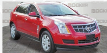
Stock #289281 2012 Cadillac SRX Crystal red tintcoat, 3.6L 6 cyl., shiftable auto, 91k miles. $13,959