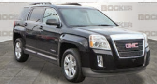
Stock #295161 2013 GMC Terrain SLE Onyx black, 2.4L 4 cyl., shiftable auto, 106k miles. $12,900