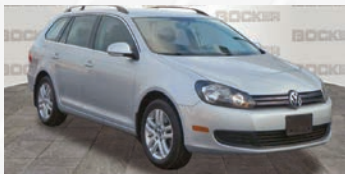
Stock #285461 2014 Volkswagen Jetta Sportwagon Silver, 2.0L 4 cyl., dual shift gearbox, 61k miles. $12,900