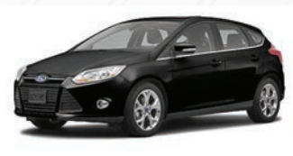
Stock #291151 2012 Ford Focus Tuxedo black met., 2.0L 4 cyl., dual shift gearbox, 125k miles. $5,500