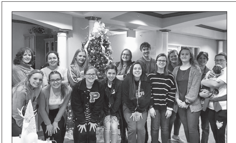
Shopper's Guide