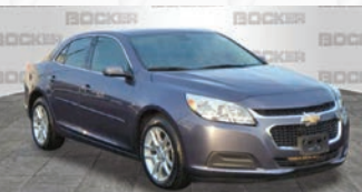
Stock #284001 2014 Chevy Malibu LT Atlantis blue met., 2.5L 4 cyl., 6 sp. shift. auto, 92k miles. $11,900