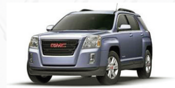
Stock #285202 2013 GMC Terrain Atlantis blue met., 3.6L 6 cyl., shiftable auto, 88k miles. $13,898