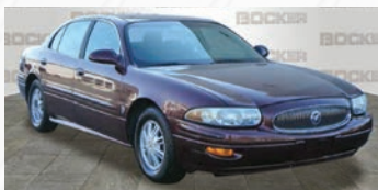
Stock #65441 2004 Buick LeSabre Custom Cabernet red metallic, 3.8L 6 cyl., 4 sp. auto, 122k miles. $4,995