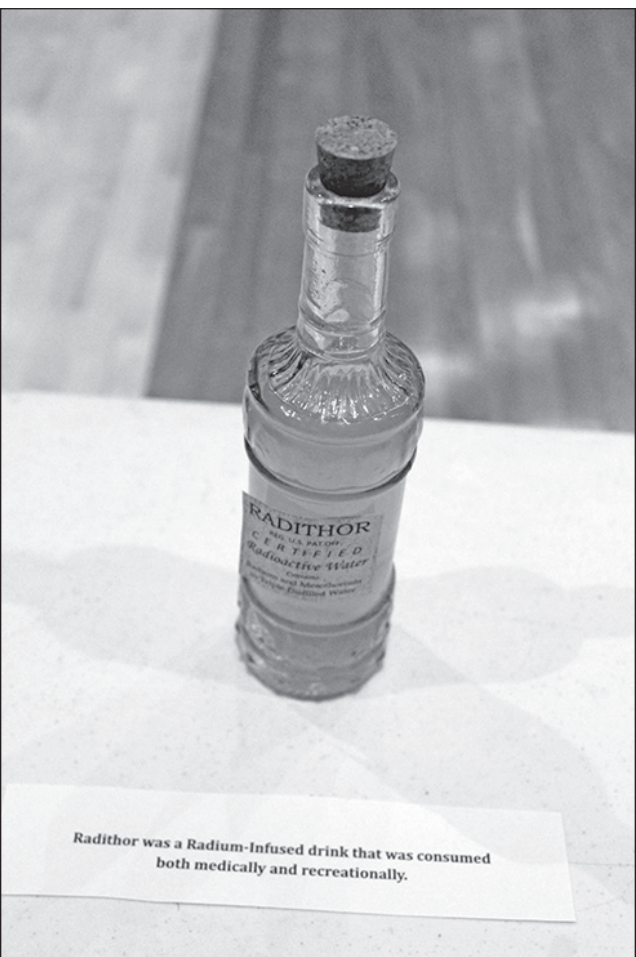
Radithor was a Radium-infused drink that was consumed both medically and recreationally.