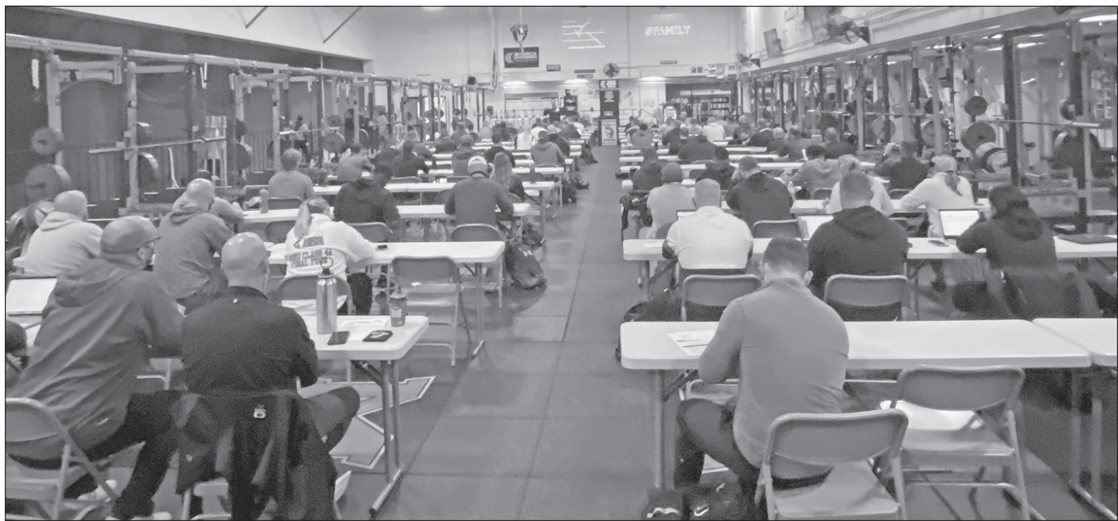
McHenry High School's recent Illinois Family Day event included strength and conditioning coaches from throughout the state, who talked about student athletes, improving speed and athlete safety.

The MCSEEP program, staffed by a director and three environmental educators, formerly housed with Planning and Development at the McHenry County Government Offices, moved their operations in summer 2020 to the Woodstock Square Mall where The Environmental Defenders has its office and book store, The Green Spot. With ample space on the sec-