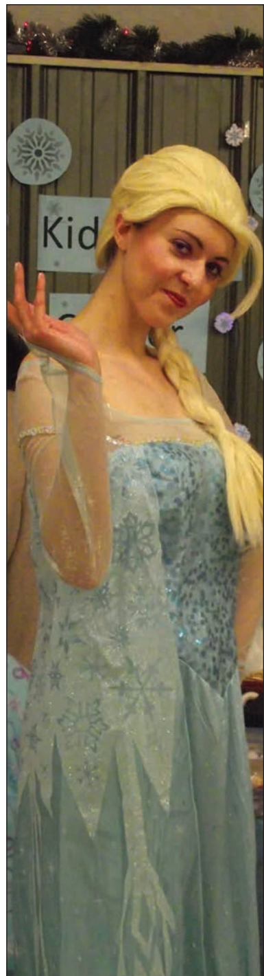
Princess Elsa waves as she waits for the next child to visit her.