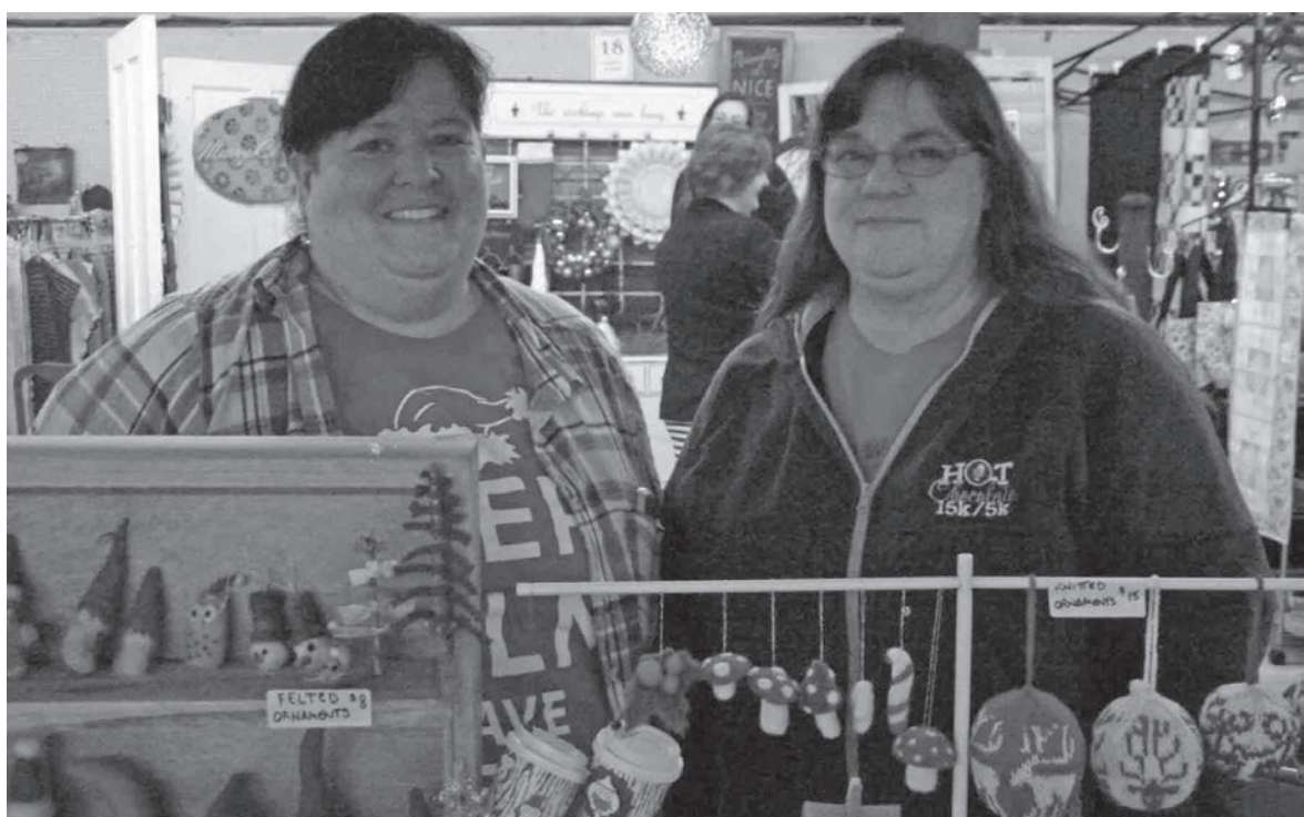
photos by Anne Eickstadt Lise Schoneberg and Annette Tures of 'Pleased 2 Treat U' offer goodies and gifts for you and your loved ones.