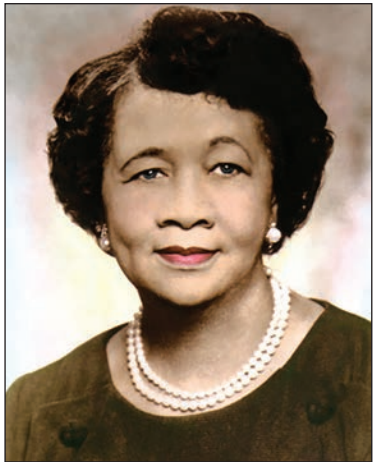
Dorothy Height was a civil rights and women's rights activist focused primarily on improving the circumstances of and opportunities for African-American women.

Dorothy Height, for whom is the award is named, was born