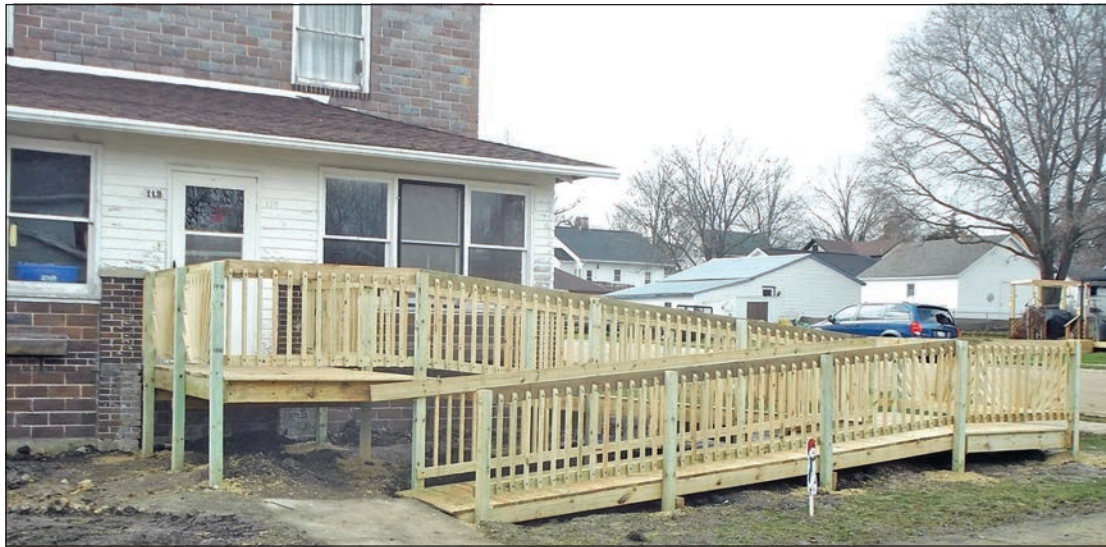
FILE PHOTO Shopper's Guide

For more information, please call (815) 601-6742