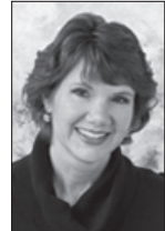
By KELLY SIMMONS Columnist

The thing about bookstores, this one and all in general, is that they are ageless. Not only are the books timeless in many respects, the bookstore entices all ages. Mothers with