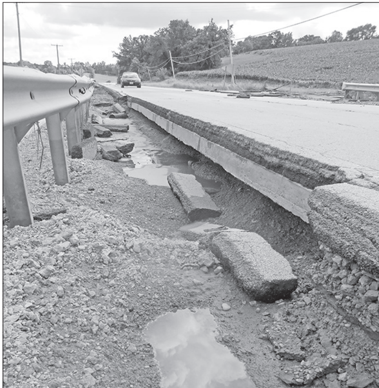
This section of the road at Louisa Road and Hwy 73 north of Lena is underlain by a box culvert that when installed was covered first with a layer of gravel, then cement, then blacktop. The gravel washed out from under the road leaving it unsupported, actually suspended. The road is closed indefinitely.

Registration can still be completed for the Master Gardener Training. To register or for more information call the University of Illinois Extension at (815) 235-4125 or visit our website at: web.extension.illinois.edu/jsw . Registration fee is $175 and includes all training sessions, handouts, and the Master Gardener Manual.