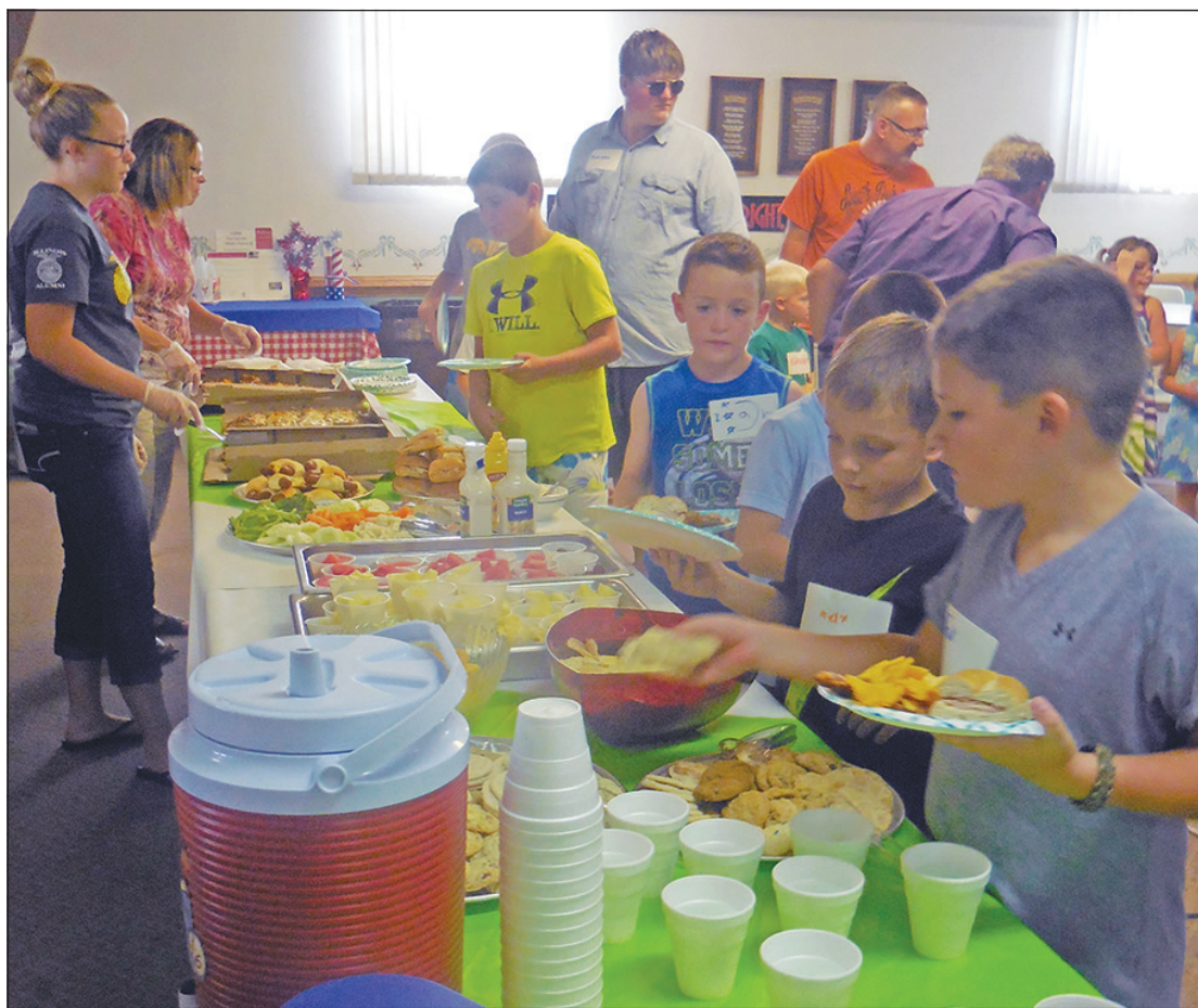
Shopper's Guide