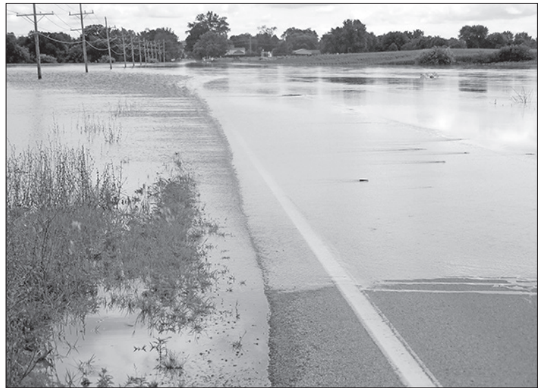
DOMINIC CARTON PHOTOS The Scoop Today/Shopper's Guide