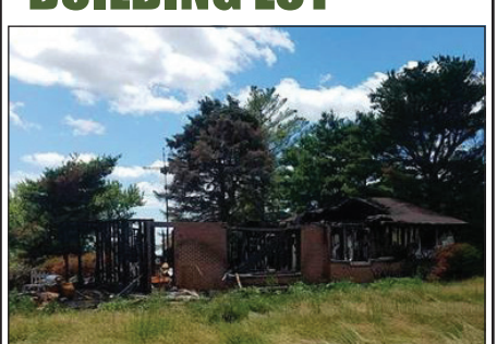
Pearl City schools, well, septic & electric on site; buildready. Broker owned.