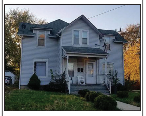
All separate utilities.