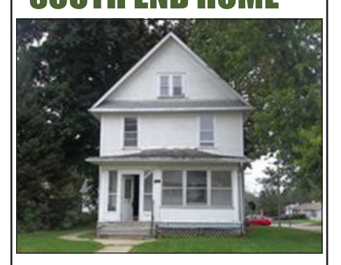
1584 sq. ft. Broker owned.