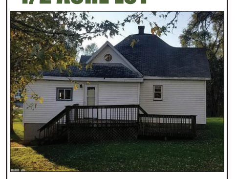
3 BR, 2 stall garage