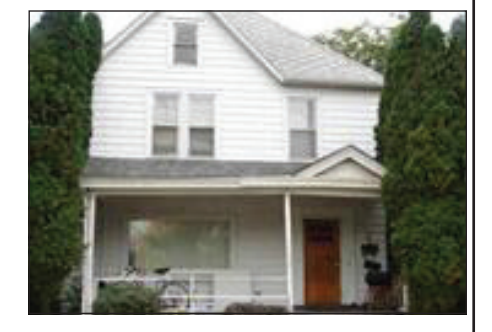
Single family or duplex property. Needs considerable