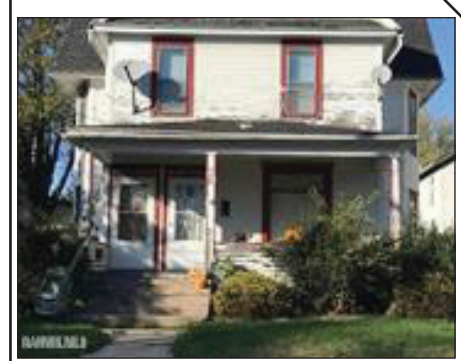
One 1 BR and 1 2 BR units. All separate utilities. Needs new roof