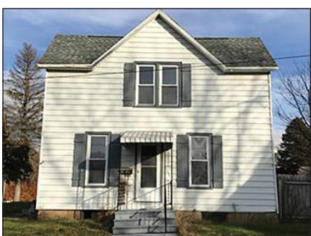
3 BR on large corner lot