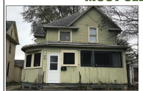
4 BR, 2 bath home, 2000+ sq. ft.