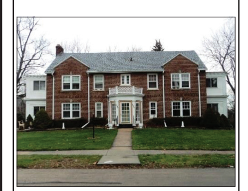
6 BR, 3.5 baths, 2 fireplaces, Single family or Duplex