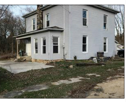
3-4 BR spacious home. Broker owned.