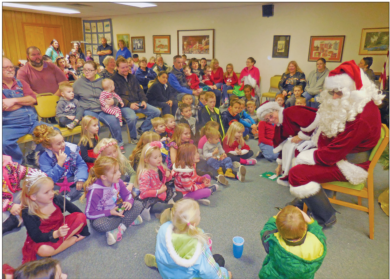
Nearly 150 "youngsters of all ages" gathered Saturday morning in the Stockton Township Public Library to Read with Santa and Mrs. Claus before heading out to enjoy the village's Walk in a Winter Wonderland festivities.

The former Bishop's Busy Big Store was packed most of the day with vendors offering everything from crafts to foods to information. The volunteers from Trinity Lutheran Church served baked goods and soups while folks from The Three Elizabeth's Guest House were kept busy helping youngsters create gingerbread houses. Members of Faith Evangelical Lutheran Church staged a beautiful living Nativity scene while Santa and Mrs. Claus held court at the Chicago Great Western Railway Depot Museum until early afternoon when Mrs. Claus departed to host the traditional story time at the craft