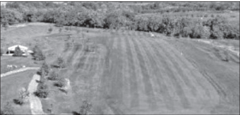
SUBMITTED PHOTO The Shopper

rolling hills of Northwest Illinois, just 3 1/2 miles North of Route 20, near the Village of Lena our course is easy to get to and ready for your enjoyment. A demanding challenge awaits you at the 6,408 yard Wolf Hollow Championship course. It's just what