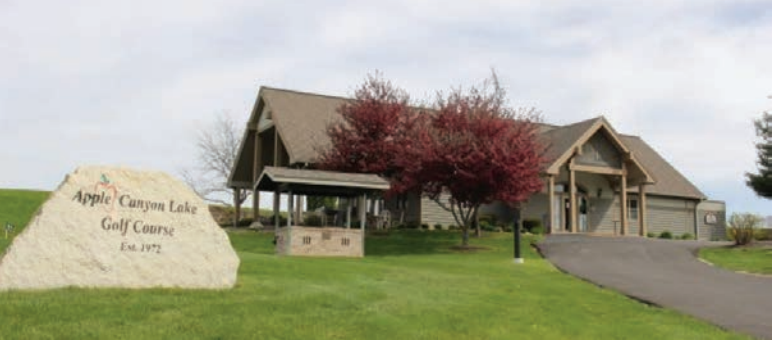
Fun new challenges await golfers at Apple Canyon Lake in Jo Daviess County.