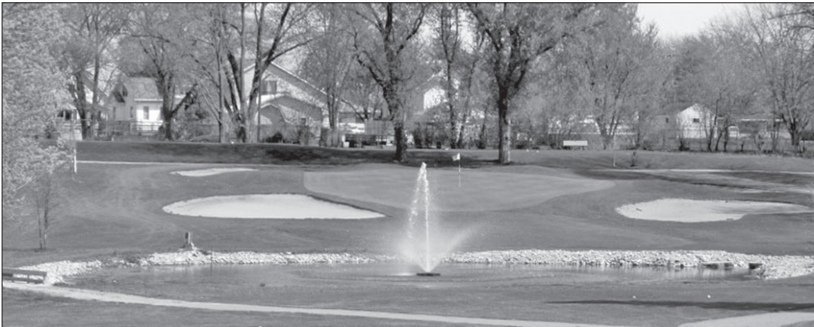
SUBMITTED PHOTO The Shopper

9 Holes - $7 18 Holes - $10 Total 9 Holes - $15 18 Holes - $20 Range Balls - $4 Specials New Member Discount Price - $450 (Or more than 3 years removed) Sunset Golf Course is located at 216 Sunset Hill, Mt. Morris, Ill. For more information, call 815-734-4839.