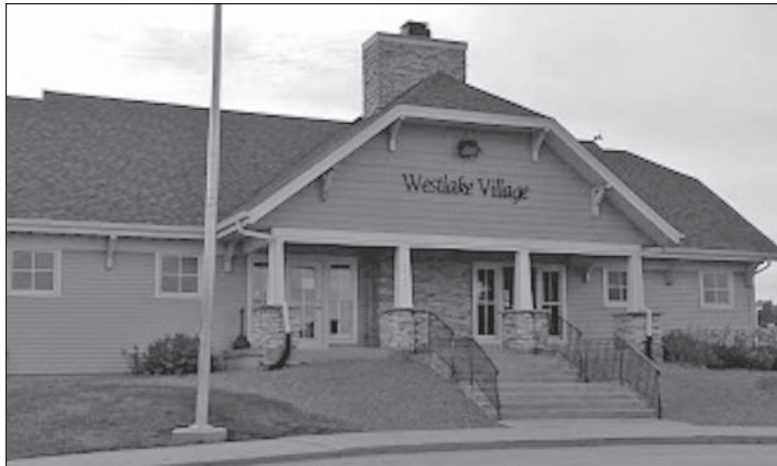
SUBMITTED PHOTO The Shopper

games on our 3 flat screen TV's. Walking Green Fees Weekday Green Fees - 9 Holes $13; 18 holes $21. Weekend & Holidays Green Fees - 9 Holes $16; 18 holes $24. Carts with Greens Fees Weekday green fees with cart - 9 holes $21; 18 holes $32 Weekend & Holidays green fees with cart - 9 holes $24; 18 holes $35 After 1 p.m. Specials Monday-Friday - 9 holes $17 18 Holes $24 Saturday-Sunday 9 holes $16; 18 holes $24. Twilight Special Twilight Special at 4 p.m. $20 *Excludes Thursdays* Twilight start time subject to change Junior Rates Junior rates 17 & younger - Valid Anytime (Except holidays) Green Fees 9 - Holes $12 18 holes $17 Green Fees with cart 9 - Holes $17; 18 holes $27 Senior Rates Senior Rates (age 60) - Available Monday-Friday (Except holidays) Green fees - 9 holes $12; 18 holes $17 green fees with cart 9 holes $17. Westlake Golf Course is located at 3820 Westlake Village Dr. Winnebago, Ill. Fore more information 815-335-7177 Read more at: http://golfwestlake.com/page/474/rates