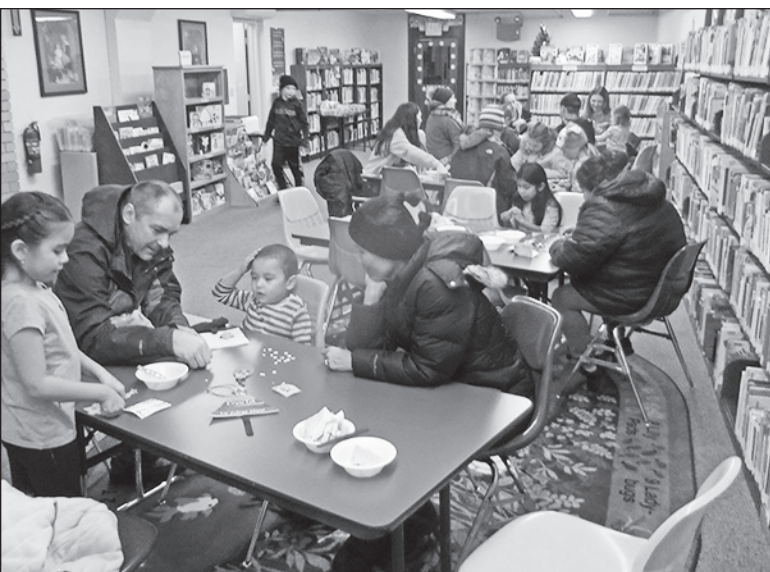
The craft area in the Lena Library stayed busy all evening during Lena's Vintage Christmas celebration.