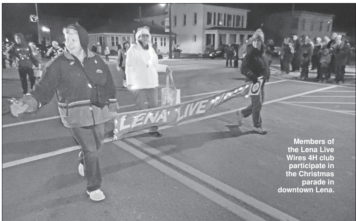
Members of the Lena Live Wires 4H club participate in the Christmas parade in downtown Lena.