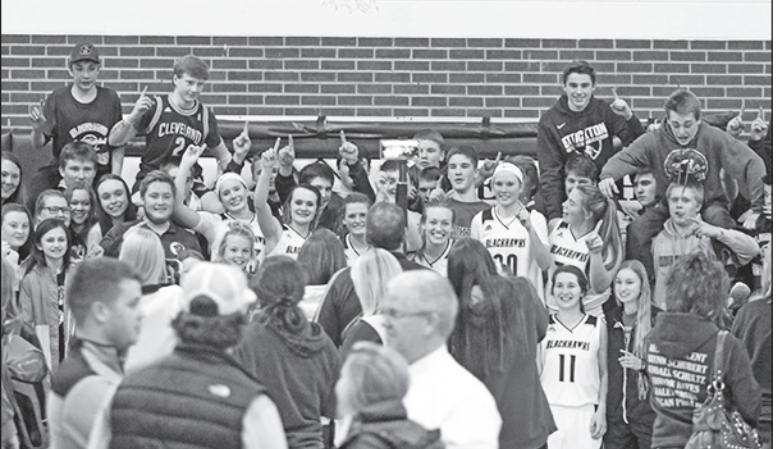
The Stockton Lady Blackhawks, their fans, and parents celebrate being Number One!

These Stockton fans celebrate big time as their Lady Blackhawks reel in a big win.