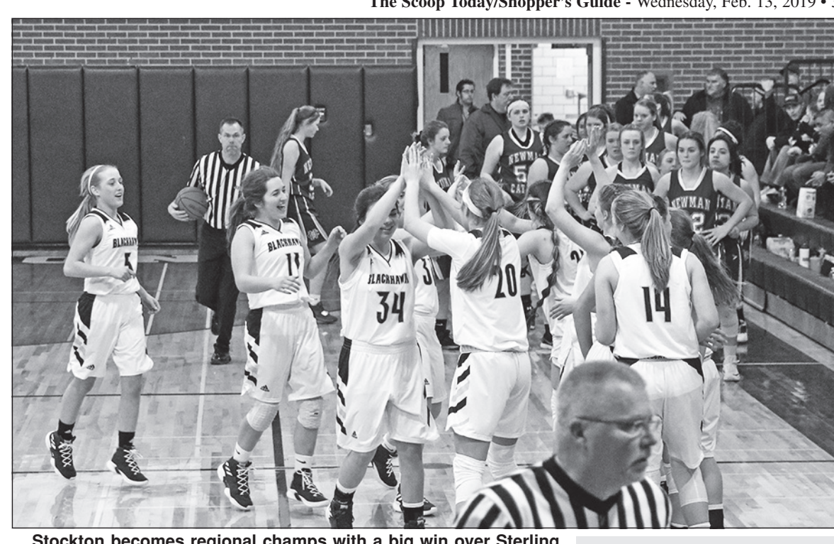
Stockton becomes regional champs with a big win over Sterling Newman 60-32.

(Right) Stockton Lady Blackhawks celebrate the school's regional win.