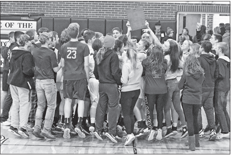
Anyone can get a quidditch trophy, but the Lady Blackhawks and their fans choose to celebrate their regional trophy.