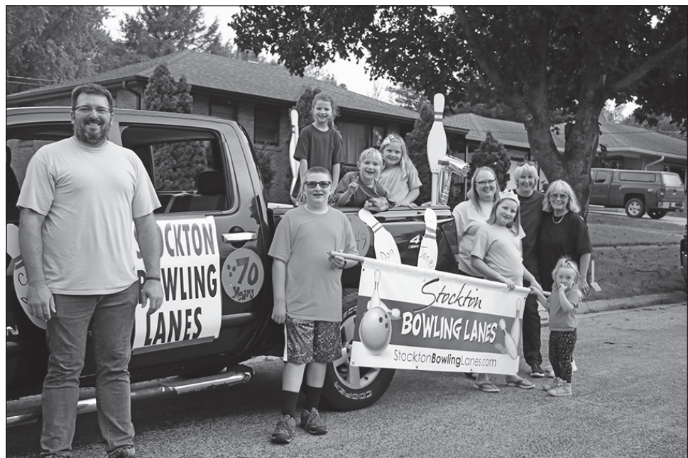
Stockton Bowling Lanes celebrate 70 years of business in the community.