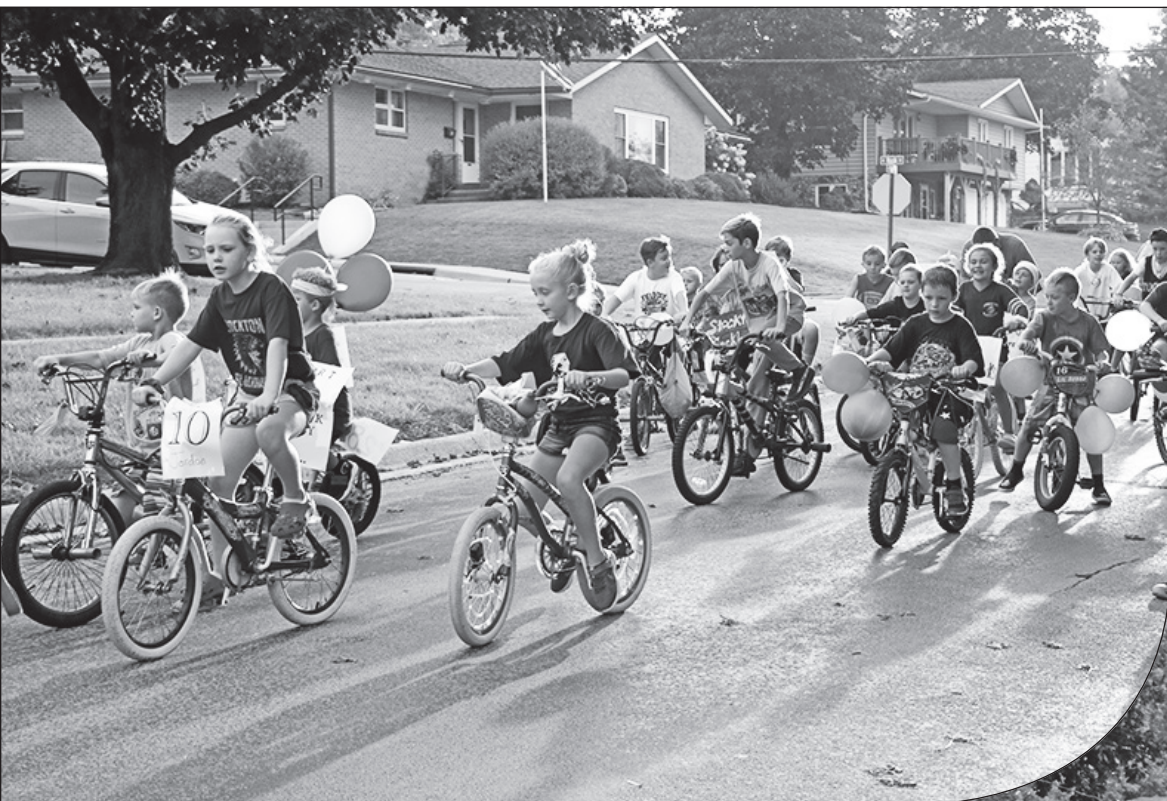
Stockton kids are always excited to ride their bikes in the parade.