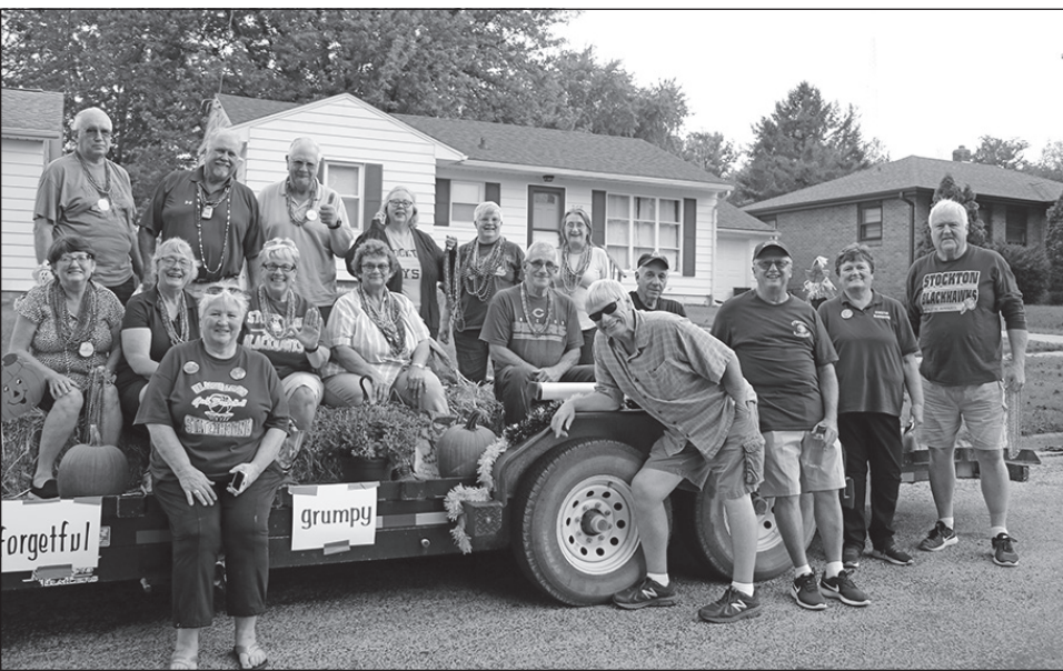
SONYA WILLIAMSON PHOTOS The Scoop Today