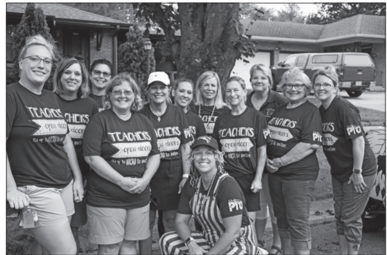
This great group of Stockton teachers participated in the homecoming parade.