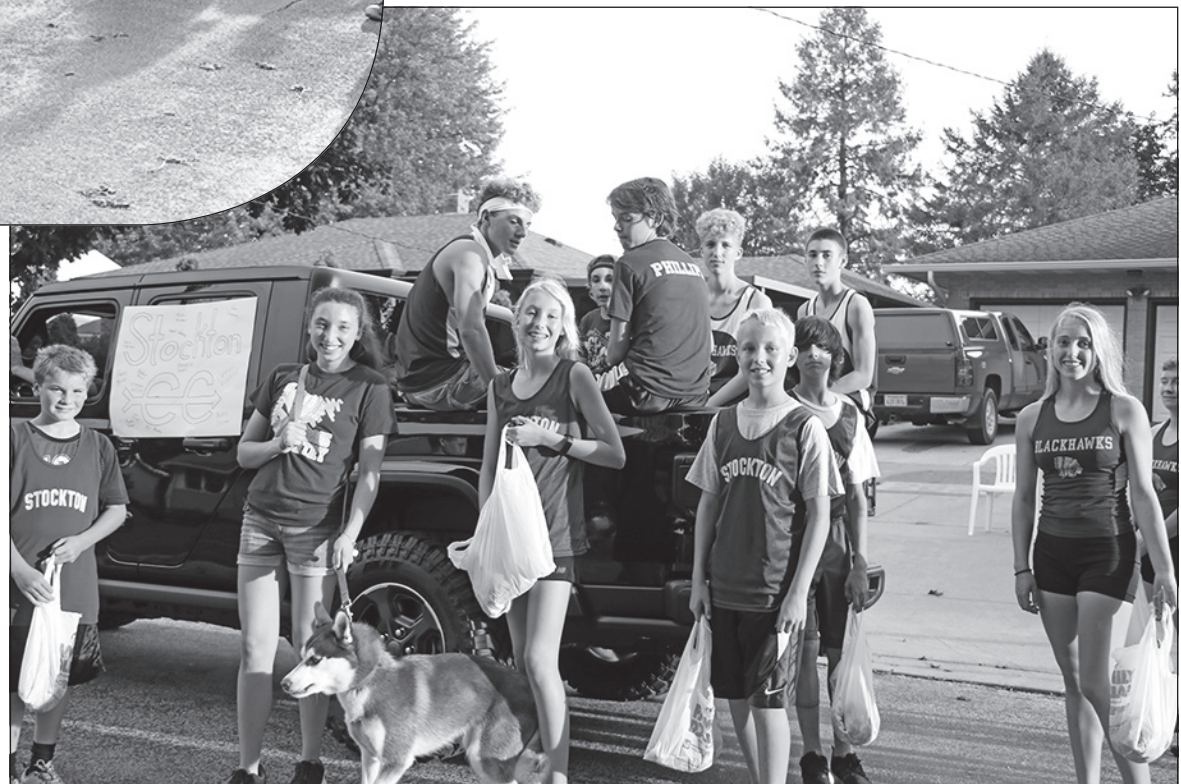
The Stockton Cross Country bring their talents to the parade.