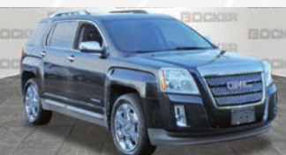
Stock #66511 2011 GMC Terrain SLT-Z Carbon black met., 3.0L V6, auto, 114k miles. $11,500