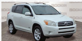
Stock #66881 2008 Toyota RAV4 LTD Blizzard pearl, 2.4L 4 cyl., auto, 136k miles. $8,995