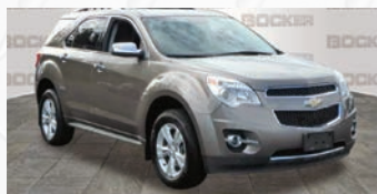
Stock #293321 2012 Chevy Equinox LTZ Mocha steel met., 3.0L V6, auto, 138k miles. $9,500