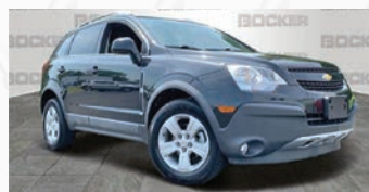
Stock #290252 2013 Chevy Captiva Sport Black granite met., 2.4L 4 cyl., auto, 59k miles. $10,956