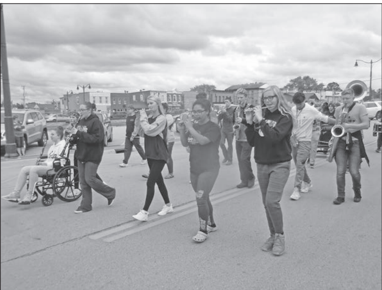
TONY CARTON PHOTOS Shopper's Guide