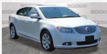
Stock #6672 2010 Buick LaCrosse CXL White diamond tricoat, 3.0L V6, auto, 65k miles. $11,420