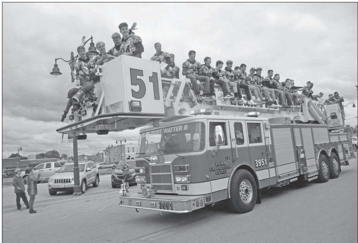
The Lena-Winslow Football teams ride proud in the homecoming celebrations.

Homecoming celebrants from the Imagine, Discover, and Learn Daycare Center cheer on their favorites while at the LeWin Homecoming parade.