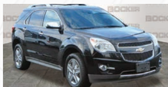
Stock #391531 2014 Chevy Equinox LTZ Black, 2.4L 4 cyl., auto, 180k miles. $8,500