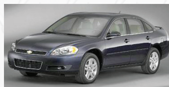
Stock #66371 2015 Chevy Impala LT Ashen grey met., 3.6L V6, auto, 54k miles. $12,900