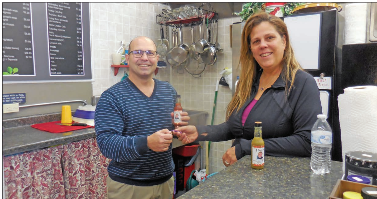
Shopper's Guide

"Not only are our sauces all natural, but there are no artificial preservatives in them," he said. "If you read the la-