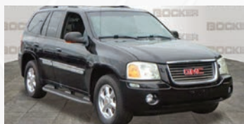
Stock #391291 2003 GMC Envoy SLT Onyx black, VORTEC 4200 4.2L 16 MPI DOHC, auto, 85k miles. $7,995