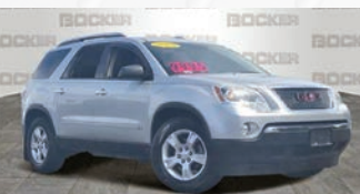
Stock #65781 2009 GMC Acadia SLE1 Quicksilver met., 3.6L V6, auto, 127k miles. $9,412