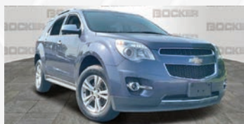
Stock #6655 2013 Chevy Equinox LTZ Atlantis blue met., 2.4L 4 cyl., auto, 143k miles. $9,987