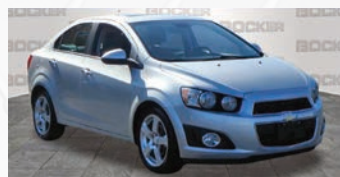
Stock #6687 2012 Chevy Sonic LTZ Silver ice met., Ecotec 1.8L I4 DOHC VVT, auto, 92k miles. $8,900