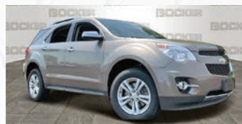
Stock #292481 2011 Chevy Equinox LT Mocha steel met., 2.4L 4 cyl., auto, 90k miles. $9,799