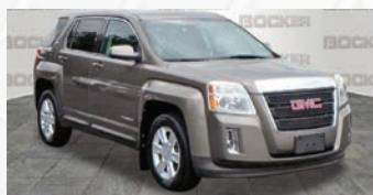
Stock #292771 2011 GMC Terrain SLE-1 Mocha steel met., 2.4L 4 cyl., auto, 95k miles. $10,159