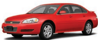
Stock #200322 2013 Chevy Impala Victory red, 3.6L V6, auto, 112k miles. $7,995