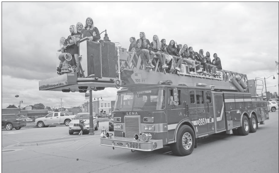
Participants in the Lena-Winslow Volleyball program wave to their fans.