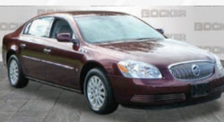
Stock #391582 2007 Buick Lucerne CX Dk. garnet met., 3.8L V6, auto, 33k miles. $9,995