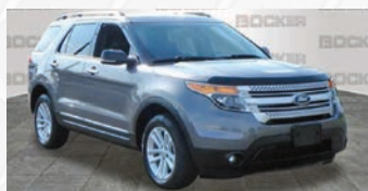
Stock #292822 2013 Ford Explorer XLT Sterling grey met., 3.5L 6 cyl., auto, 163k miles. $11,943