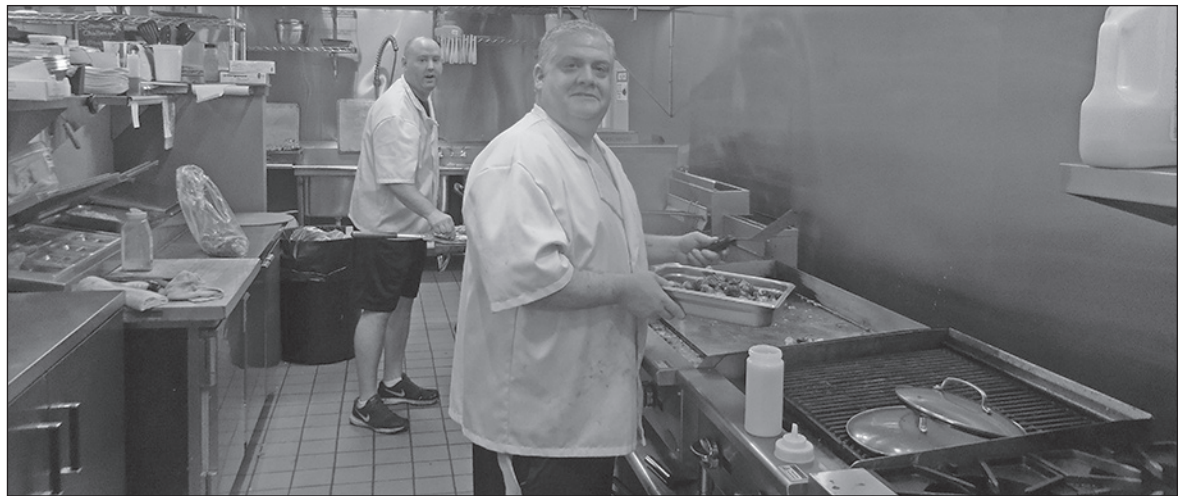
TONY CARTON PHOTOS The Scoop Today