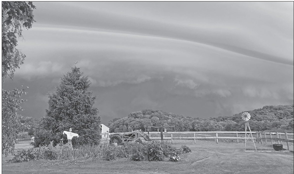
The Scoop Today

Did you know the Jo Daviess Conservation Foundation is a local, member supported non-profit