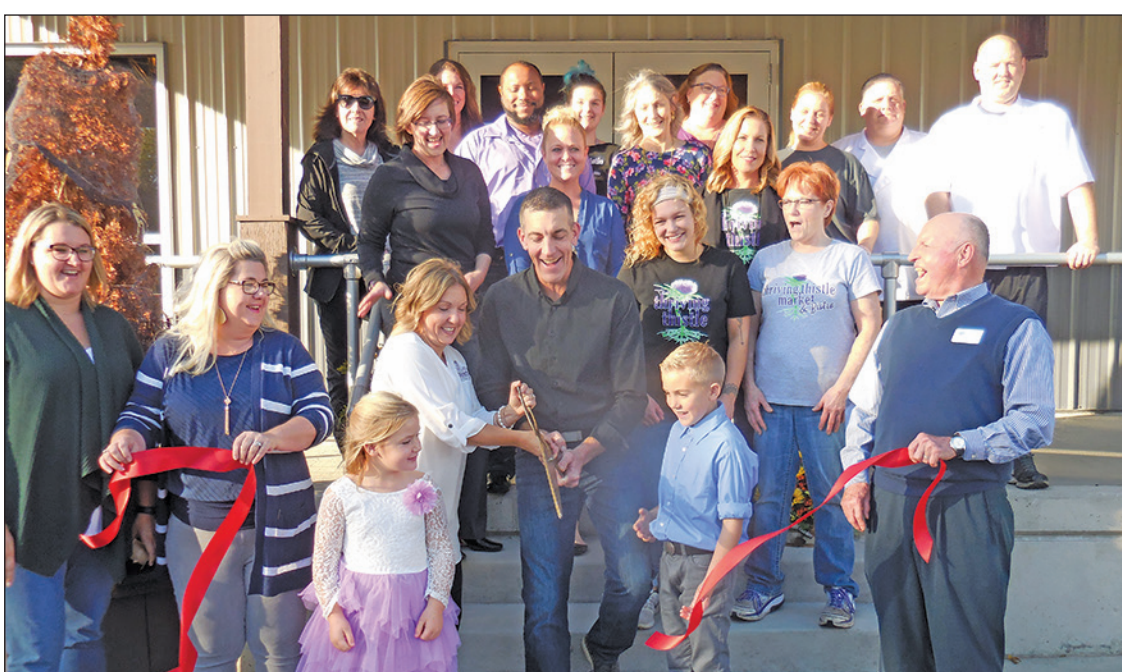
TONY CARTON PHOTO The Scoop Today