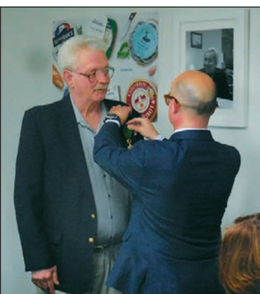
TONY CARTON PHOTO The Scoop Today/Shopper's Guide