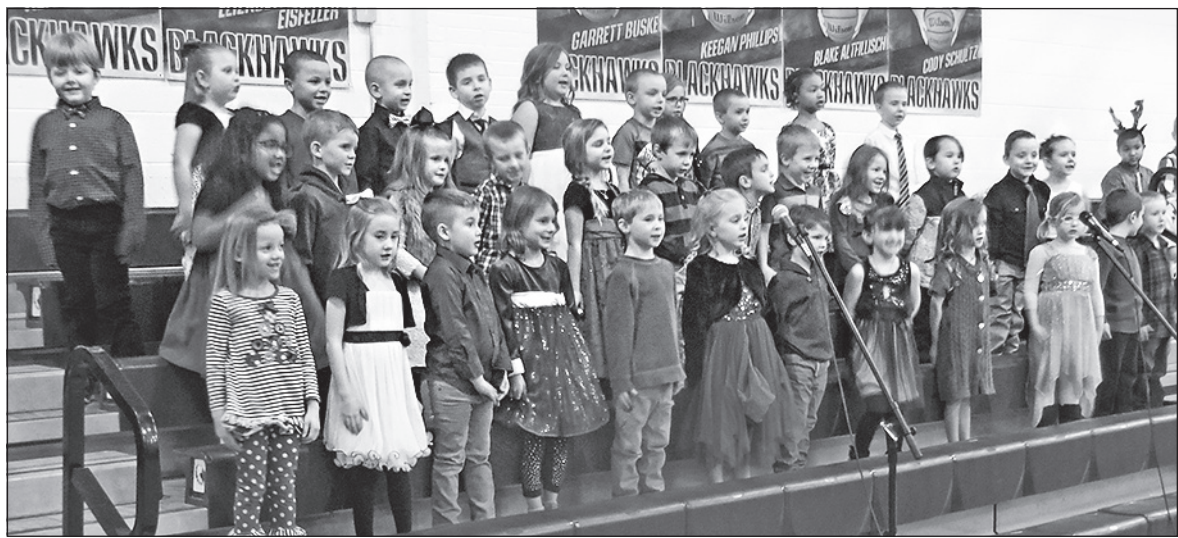
TONY CARTON PHOTOS The Scoop Today/Shopper's Guide