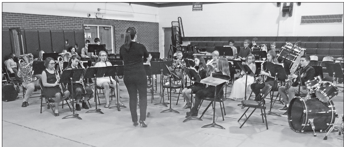
The Stockton Sixth Grade Band offers a lively performance of "Jolly Old Saint Nicholas."