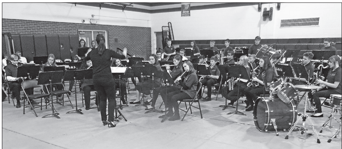
The Stockton Junior High Band performs everybody's holiday favorite, "Jingle Bell Rock."

The Stockton Community Unit School District is soliciting bids for Gasoline, 5% Bio-Diesel Fuel, and Propane Fuel for the period of January 1, 2020 – December 31, 2020.