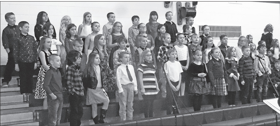
The Stockton Third Grade rocks to the tune of "Rockin' Around the Christmas Tree" during the school's Winter Concert.