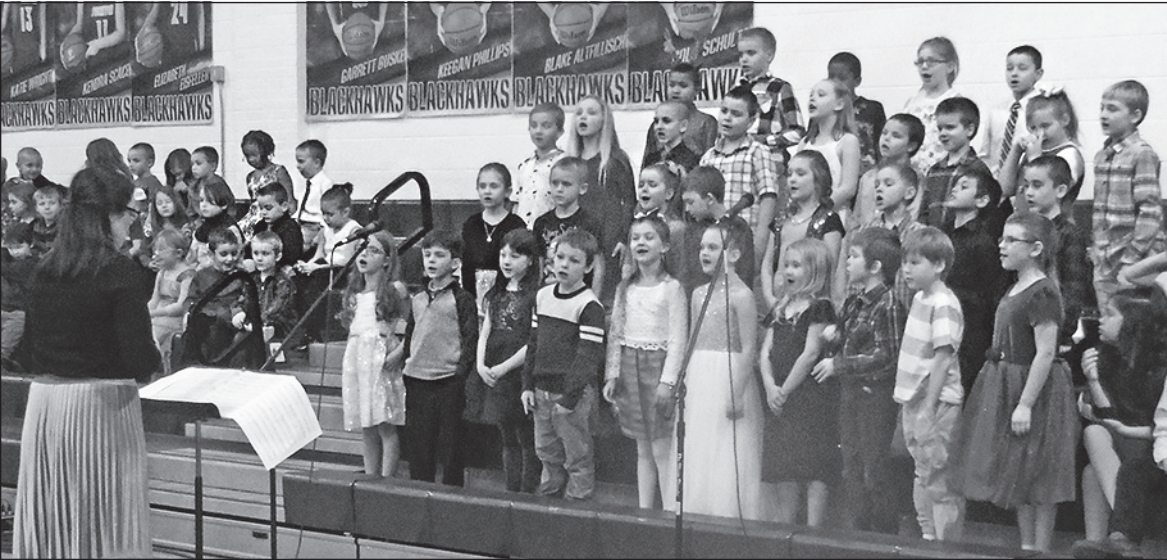
The Stockton Second Grade performs "It Came Upon a Midnight Clear."