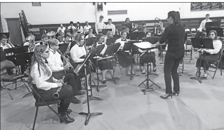
The Stockton Senior High Band brings the overflow crowd to its feet with their version of, "Polar Express."