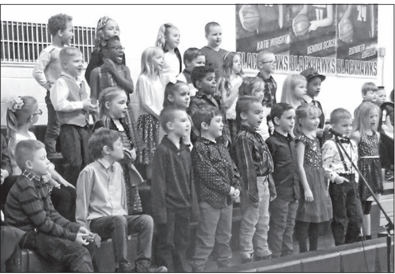
The Stockton First Grade steals the show with "The First Noel."