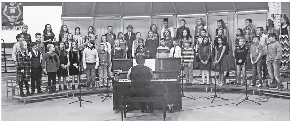
The Stockton Fifth Grade Chorus opens its segment of the evening's performances with "Here Comes Santa Claus."

With the perfect, 4-0 start, the Blackhawks are primed and ready to make another deep run in the post season this year.