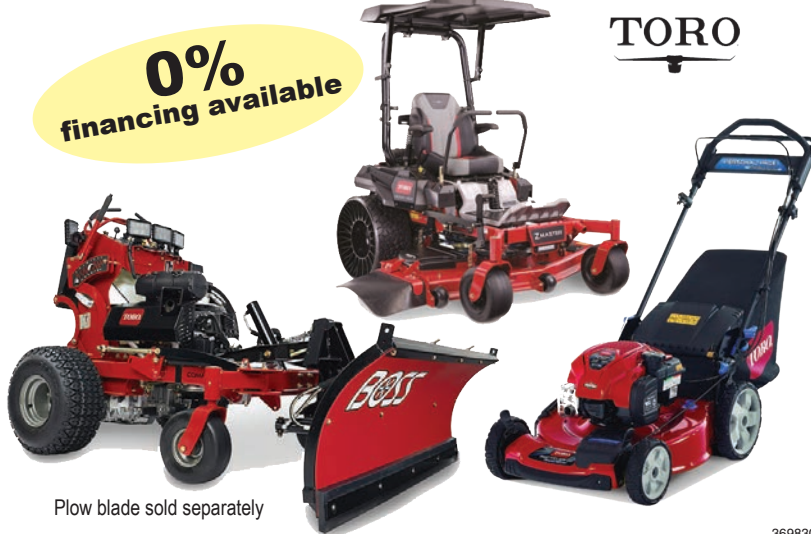
Plow blade sold separately