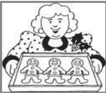
The not so skinny cook

I guess we are in Week 3 if you started with April 1. Things are getting a little boring and slightly nutty at my house.