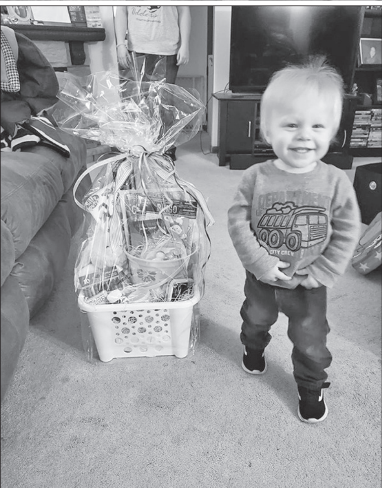
Shopper's Guide