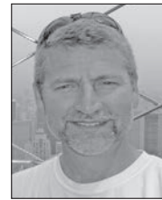
By SCOTT CERNEK Columnist

The first time I drove a tractor I was just six years old. My brothers and I all learned to drive on my Dad's 25 horsepower NAA Ford Jubilee tractor. It was easy for a youngster to learn to drive on that Jubilee because there weren't many controls, and all you had to do was stand up on the clutch pedal with all your weight and it would roll to a stop. Most other clutches you had to push forward, and it was hard for a little guy to muster up enough strength to push the clutch in. That little Ford could pull a two bottom plow and a ten foot disc, but what we mostly used it for was pulling an implement we called a cultipacker and also for raking hay. I really thought I was something when my Dad let me cultipack for the first time. I felt like a million bucks. There I was farming in the fields with the big boys.