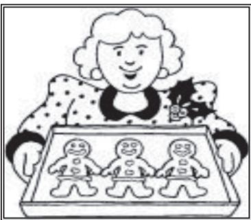
The not so skinny cook

Things are opening up, the weather is way warmer and the bugs have arrived! Two out of three good things happening make for a banner week. And this week's recipes feature some of those Vidalia onions again and an interesting no-bake dessert. There is a baked one if you really need one!