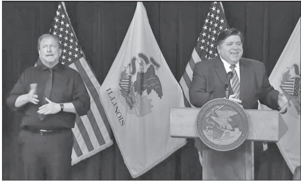
BLUEROOMSTREAM.COM PHOTO The Scoop Today/Shopper's Guide

The system has about half the reach it needs, Pritzker said, and officials are "rapidly" trying to grow the program. More than 80 local health departments are working with the state to build that