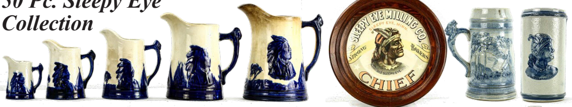
50 Pc. Sleepy Eye Collection