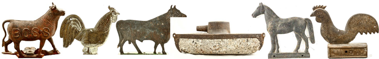
A Collection of 30 Different Windmill Weights at NO RESERVE!

Viewing Friday, July 17, Noon to 8 p.m.; Saturday & Sunday 8 a.m. to auction start at 10 a.m. Saturday auction features windmill weights, crocks, sleepy eye, duck decoys, clocks, furniture & tons of smalls