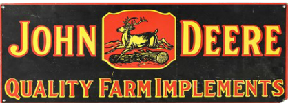
Advertising and Country Store Items, Coffee Mills, Tins, etc.