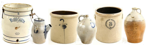
35 Crocks and Jugs. NO RESERVE!