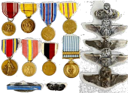
Medal & Insignia Groupings