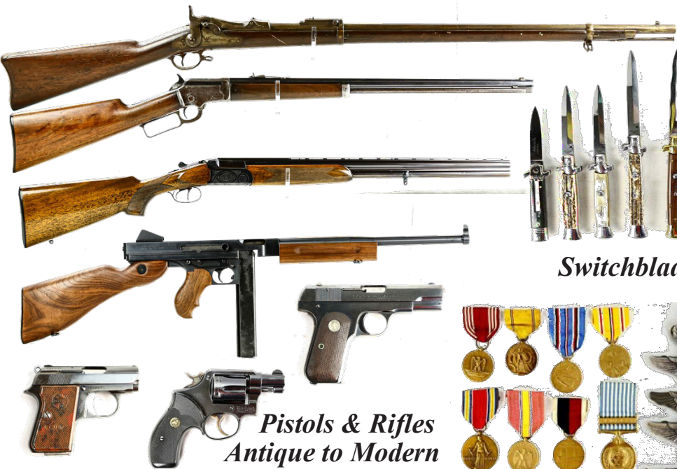
Pistols & Rifles Antique to Modern

ATTENTION REENACTORS This auction features a large quantity of original U.S. WW II items great for battle reenactments. Also includes German, Russian, and other military items. Not to be missed!