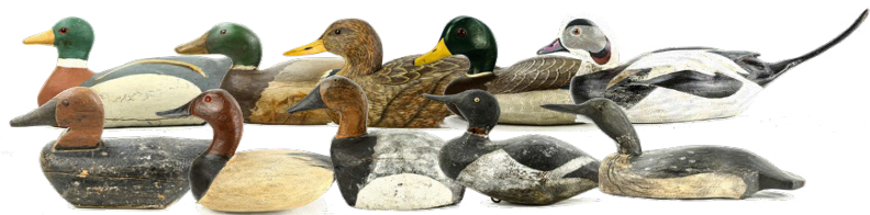
50 Decoys - Many Named. NO RESERVE!