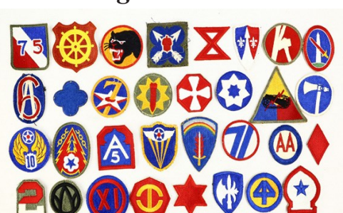
100's of Patches & Insignia