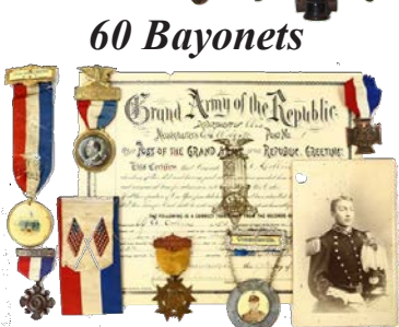
Civil War & GAR