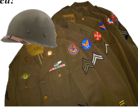
Many U.S. WW II Uniforms and Original Field Gear