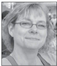
By JILL PERTLER Contributor

As quick as you can say, "Dive" the eagle did just that and came off the surface of the lake with a fresh fish in