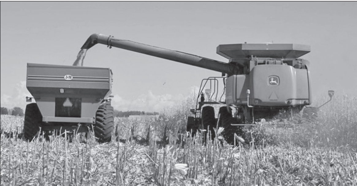
SUBMITTED PHOTO The Scoop Today

Condolences may be sent to the family at www.leamonfh.com .