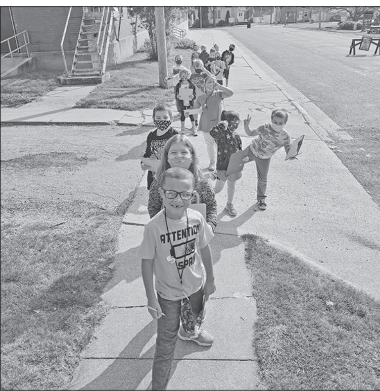
The Scoop Today