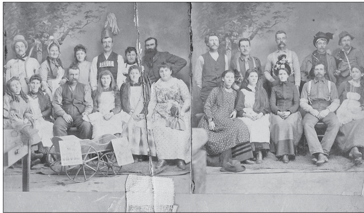
Shopper's Guide

A picture donated to the Stockton Heritage Museum shows a group of folks who were in a play to raise money for the establishment of what was to be Ladies Union Cemetery. Today, the cemetery is the site of the museum's Cemetery Challenge, which encourages people to explore those who were key in establishing the village.