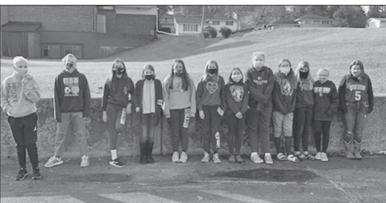
SUBMITTED PHOTOS The Scoop Today