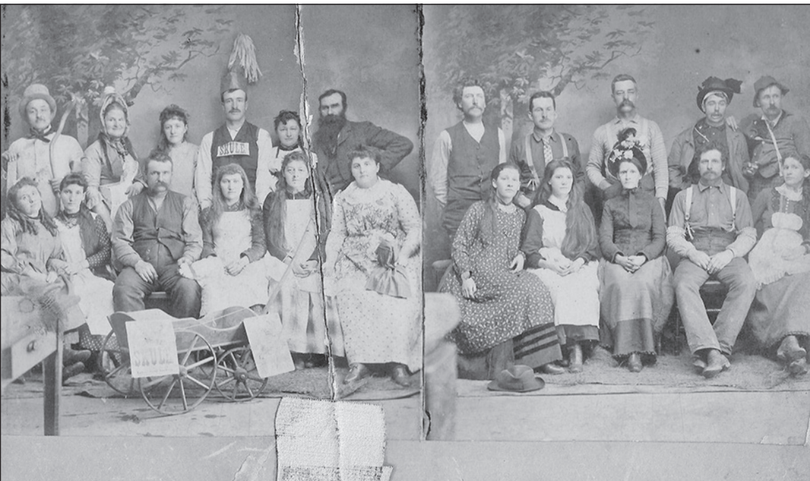
The Scoop Today

Social distancing standards will be in place.