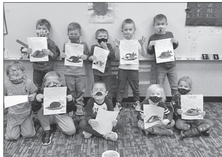
SUBMITTED PHOTO Shopper's Guide

First, get it from the store. Next, open it and then put some