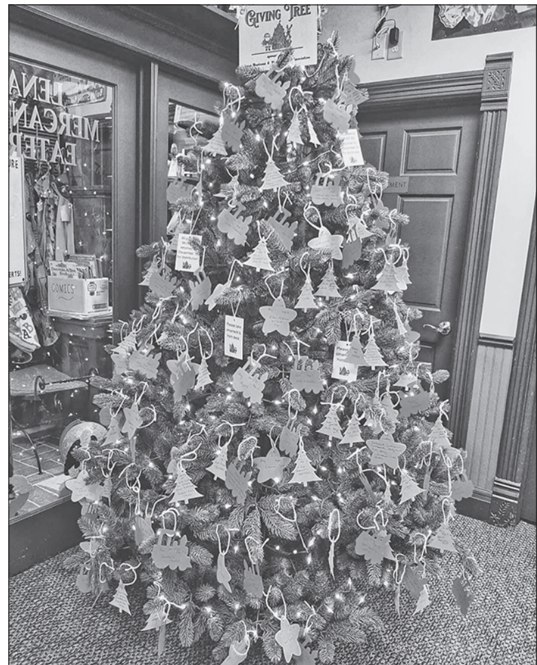
SUBMITTED PHOTO Shopper's Guide

(Right) The Giving Tree, located at Lena Mercantile, offers a way to help local families in need this holiday season.