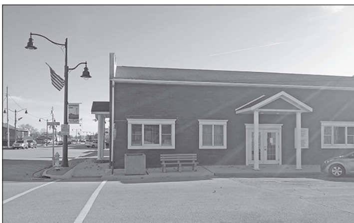
Shopper's Guide