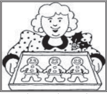
The not so skinny cook

As I write this, we have one last warm day. The wind is still whipping things around, but it brought warm air. Thanksgiving is coming, and I know that many celebrations will be different this year. This week's recipes can be used for the holiday or used as leftovers. Enjoy cooking for whomever you will be with during this unique Thanksgiving 2020.