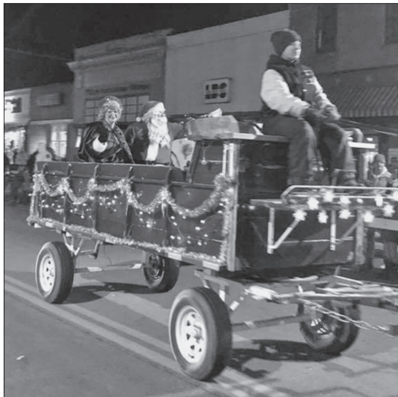
SUBMITTED PHOTO Shopper's Guide

The Giving Tree is already up at Lena Mercantile. Each ornament fea-