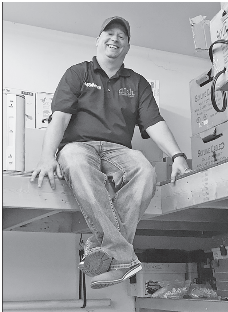
Shopper's Guide