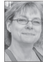
By JILL PERTLER Contributor

Hide-and-seek has changed at our house, as many things change when you progress from being nearly 2 to nearly 2 1/2. That is the case of our granddaughter.