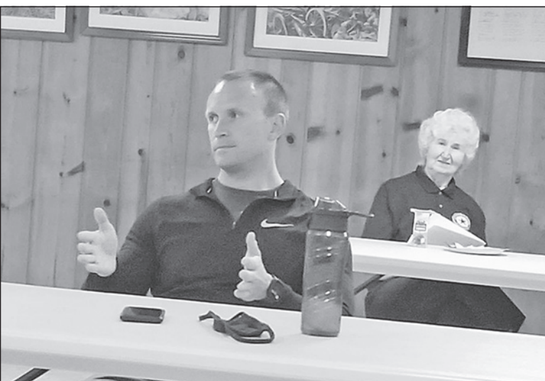
SUBMITTED PHOTO Shopper's Guide