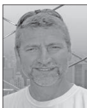
By SCOTT CERNEK Columnist

It has been a tremendous fall for the crop farmers here in the Midwest. Except for just a very few days of rain, the weather has been almost perfect. The corn and beans are almost all out of the fields before Thanksgiving to boot. In a year when there have been more than a few difficulties in our world, this is truly a blessing and something we can be thankful for on the farm. If we look back, the landscape of the fall harvest is so different now than what it used to be. I remember when I used to hurry home from football practice in hopes that I would be able to haul in a few loads of ear corn to run up into the corncrib on the old Kewanee elevator. We had two corncribs that we filled each fall. Then throughout the year we would grind the corn for the young stock. It made for some good feed for those replacement heifers or to fatten up the steers.