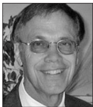
By HAROLD PEASE, PH.D. Columnist

The constitutionally ill-informed like to refer to the "separation of church and state" as the rationale for a prohibition of religious or seasonal expression in public places. No such language exists in the Constitution.