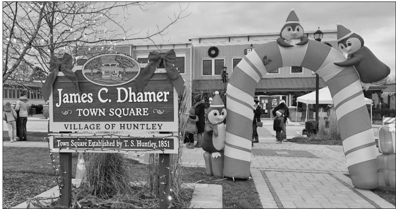
The mayor and village board in Huntley invite residents and visitors to enjoy Huntley and all it has to offer, and to join them in welcoming new businesses to the village.

We wish you all a very happy and healthy holiday season, and an even better New Year!