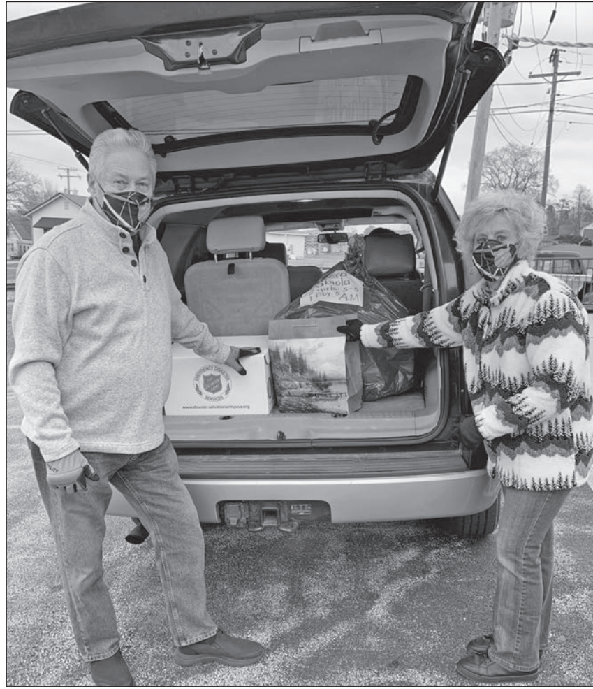
Salvation Army volunteers place boxes of food and bags of toys in the back of vehicles for families to use to celebrate Christmas.

"It's a wonderful thing that our community comes together to do things like this," he said. "We're very blessed."