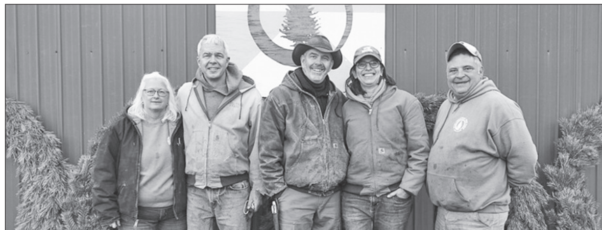
SUBMITTED PHOTO The Scoop Today

A guide to tree varieties can be found on the ICTA's website, ilchristmastrees.com , under the "comparing varieties" tab.