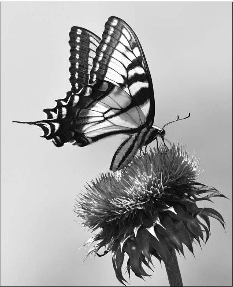
Dan Van Den Broeke of Roscoe entered a photo of a butterfly resting softly on a flower.