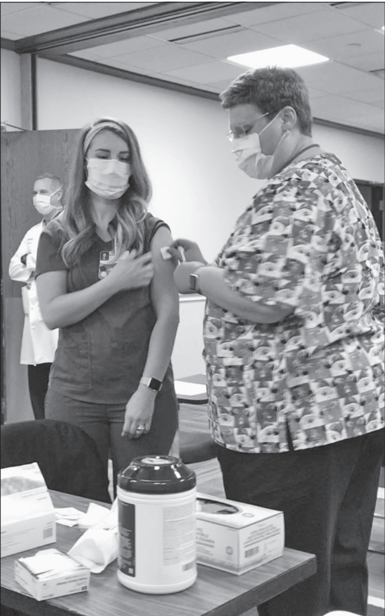
SwedishAmerican personnel line up to receive COVID-19 vaccinations.

SwedishAmerican, a division of UW Health, began administering its first COVID-19 vaccines to employees Thursday, Dec. 17, bringing hope to many frontline healthcare workers who have been working tirelessly for months during the pandemic.