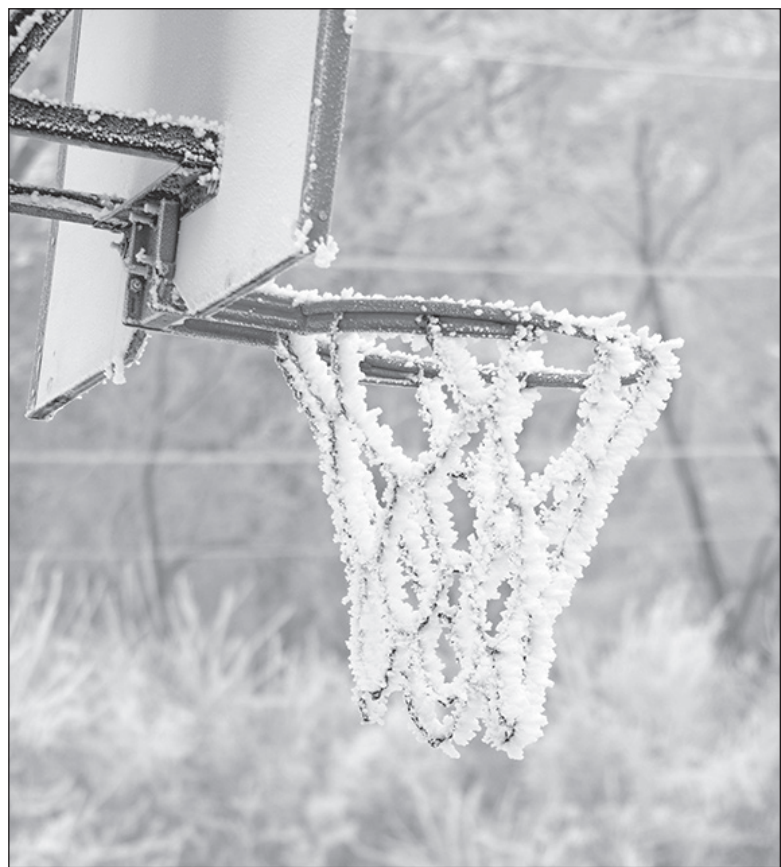
SONYA WILLIAMSON The Scoop Today

For more information or to receive a brochure, contact Schwab at 319-472-4739.