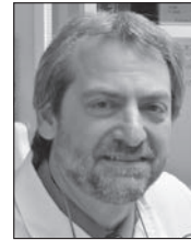
By DR. STEPHEN PETRAS

A toothache in the middle of the night really can be a nightmare. Try rinsing your mouth with warm salty water to clean it and decrease the inflammation. Alternate taking acetaminophen (generic/Tylenol) and ibuprofen (generic/Motrin/Advil, etc.) Do not put aspirin or any other painkiller on the tooth or gums. Remember, painkillers only treat the symptom, not the cause. See your dentist as soon as possible.