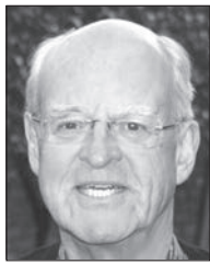
By JIM NOWLAN

A couple of election cycles ago, a friend of mine tallied the total number of votes across Illinois for Democratic and Republican House candidates, respectively. He found that Democrats received 50 percent of the total vote, yet won 60 percent of the legislative seats. (That is what is called "gerrymandering," in honor of Massachusetts Governor Elbridge