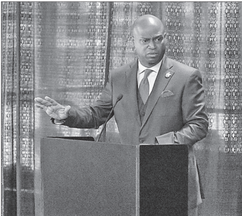
Speaker Emanuel “Chris” Welch takes questions from members of the news media on Jan. 13, the day he was chosen as Speaker of the Illinois House.

It will be some time, though, before the House is able to fully get back to work. Welch had announced that the House will come back into session on Feb. 10 for the sole purpose of adopting new rules, which are expected to allow for remote committee meetings that will then occur regularly over the next couple of months. But other substantial action at the Statehouse in Springfield is unlikely to occur until at least sometime in April.