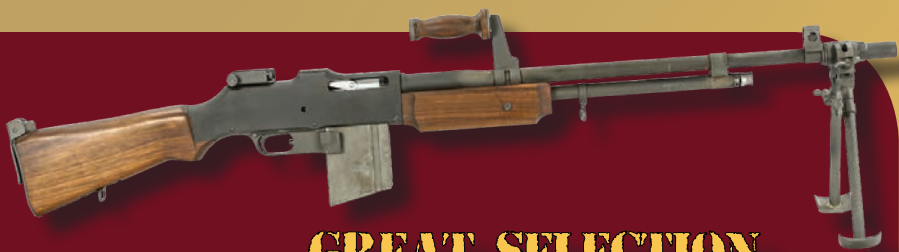
GREAT SELECTION OF WWII WEAPONS