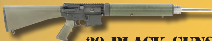
30 BLACK GUNS