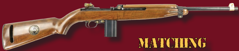
MATCHING SERIAL NUMBERS