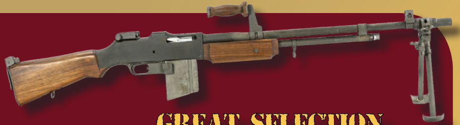
GREAT SELECTION OF WWII WEAPONS