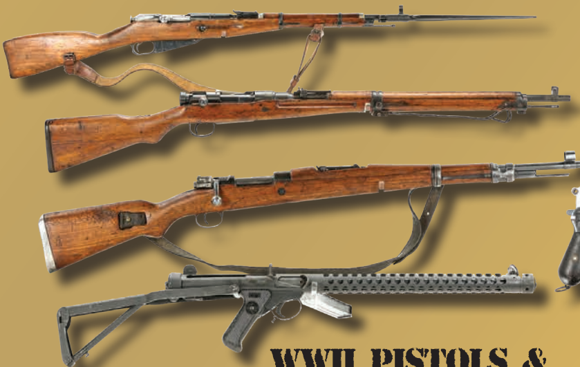
WWII PISTOLS & LONG GUNS