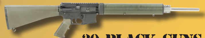
30 BLACK GUNS