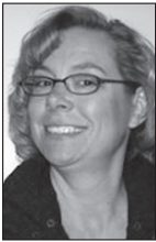
By JILL PERTLER Columnist

I was right, and wrong, at the same time. I am normal, but not like most people. My normal involves a living with condition called aphantasia, which is the inability to voluntarily create a mental picture – or map – in your head. People with aphantasia are unable to picture a scene, person, or object, even if it's very familiar.