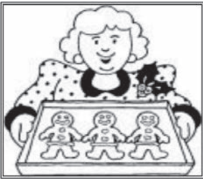
The not so skinny cook

I think I could have started this column the same as last week's column. However, I think we hit a new cold temp for two of those days last week. I opened the blinds when it got to twenty degrees to see the sun. Maybe February will be kinder to us. This week's recipes are still good ones for cold weather.