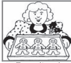
The not so skinny cook

International Toothache Day reminds us to take advantage of our access to community fluoridated water and its enamel strengthening properties. We can also prevent toothaches by decreasing our consumption of sugary and acidic beverages and food. It also serves as a reminder to replace a worn and frayed toothbrush before it harms our oral tissues.