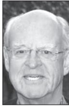
By JIM NOWLAN

Here's The Deal: Lawyers and judges elevated to the Illinois Supreme Court by the Judicial Nominating Committee of the Cook County Democratic Party are allowed to be the best jurists they can be on 90-95 percent of the cases before them. But, on any cases affecting the Party, such as redistricting reform, they must commit themselves to protect the Party.