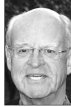
By JIM NOWLAN

globe during World War II, with our sacrifice and materiel. When I grew up post-WWII, America was on top. The rest of the developed world was prostrate from war devastation. We had some swagger. We were positive and generous. It was a great