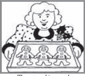
The not so skinny cook

Line a large baking sheet with parchment paper. Roll out the crescent dough and separate by the triangles. Cut each triangle in half to create smaller same shape triangles. Starting at the bigger end of each triangle, lay a small square of cheese, topped with a sausage, then roll up on itself. Lay on the baking sheet. Continue until all 30 pigs in a blanket are on your baking sheet. In a small bowl, combine the melted butter, ranch pack seasoning, and parmesan. Brush the rolled-up pigs in a blanket with the butter. Bake for 12 to 15 minutes or until the dough is browned and cooked through.