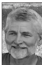
By SCOTT CERNEK Columnist

of summer in an instant it seemed. The sunshine was warm and invigorating and the grass and alfalfa came shooting up out of the ground like crazy. Because of the moisture and heat, I was able to get my four beef cows out onto pasture earlier than normal. Two of them have