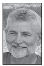
By SCOTT CERNEK Columnist

This summer is shaping up to be a lot like the summer of 1988 only without the super intense heat that we had in that summer back then. I'm sure many of us remember that year well. I remember getting a shower on Mother's Day in early May in '88 and then there was no rain until the day of our firstborn son's birth on July 22. The big difference between this year and that year was that in 1988 there was something like twelve consecutive days of triple digit heat in July. The ground dried up like powder and there was next to nothing in the fields at harvest. If a farmer got thirty bushels to the acre corn he was doing well. That was thirty-five years ago, and it still seems like yesterday. There was also the drought of 1976 that I remember as being a bad one too. In those days we and most of our neighbors were growing seed corn for the DeKalb company on some of our land. When it came time to harvest each