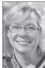
By JILL PERTLER Columnist

Life changes us. Sometimes in increments, like accidentally stepping off the curb. Sometimes in ways akin to falling off a cliff. It's these cliff-changing moments that transform us in ways we never could have imagined—before. It's like falling from one world into another—into a life so different that your old life can only be referenced as "before."